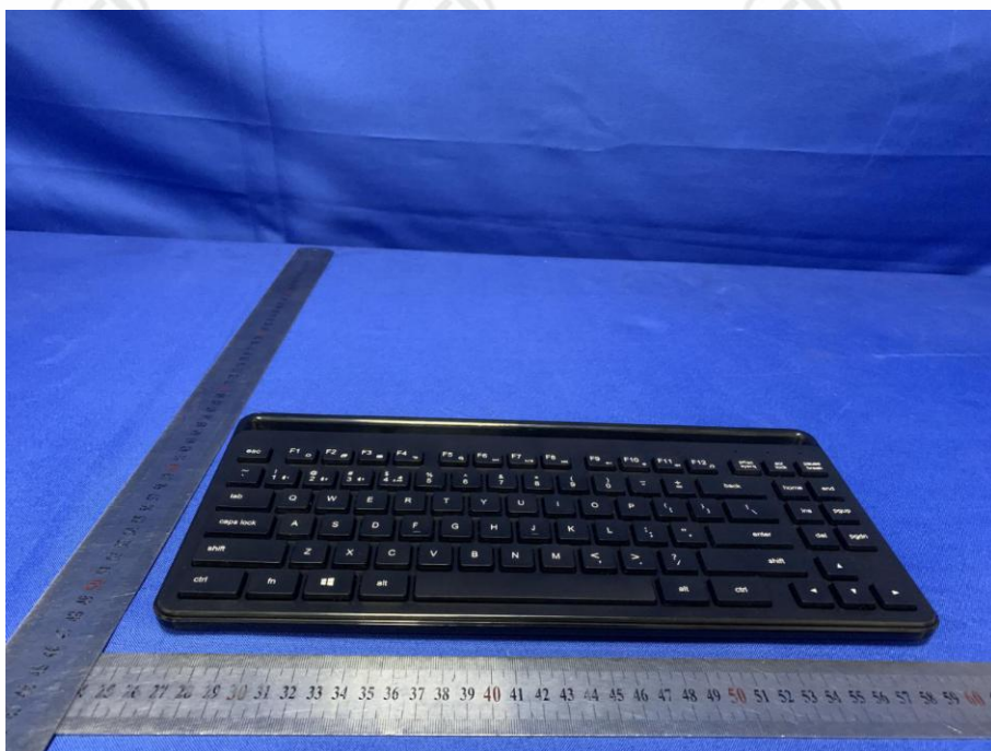
View of Product-2