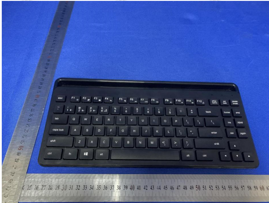
View of Product-1