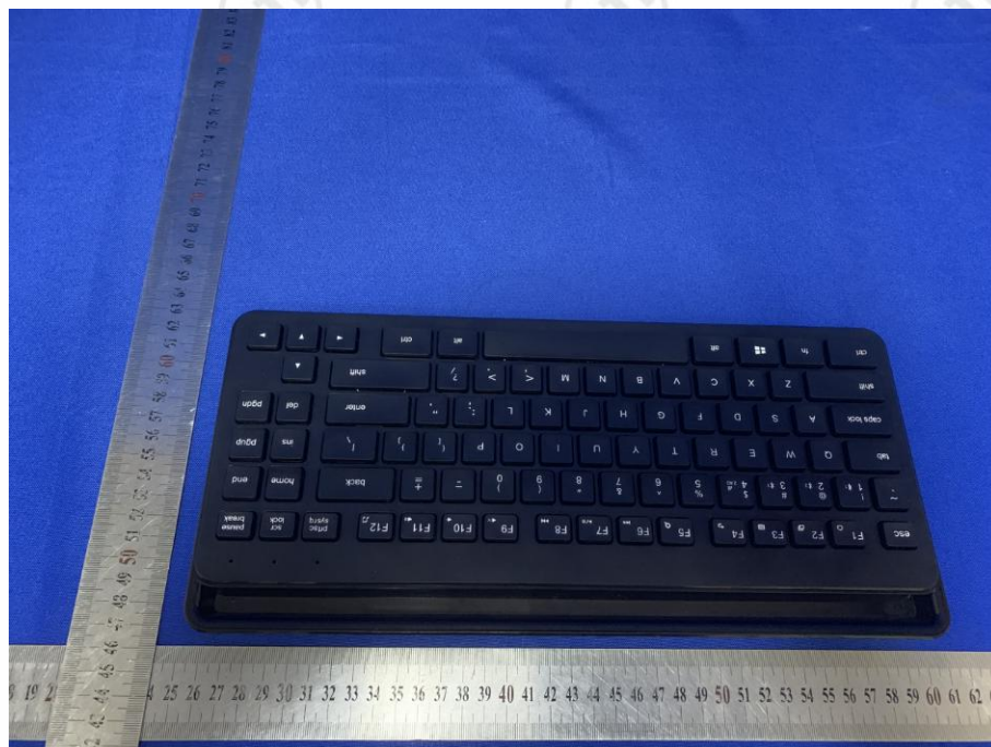
View of Product-4