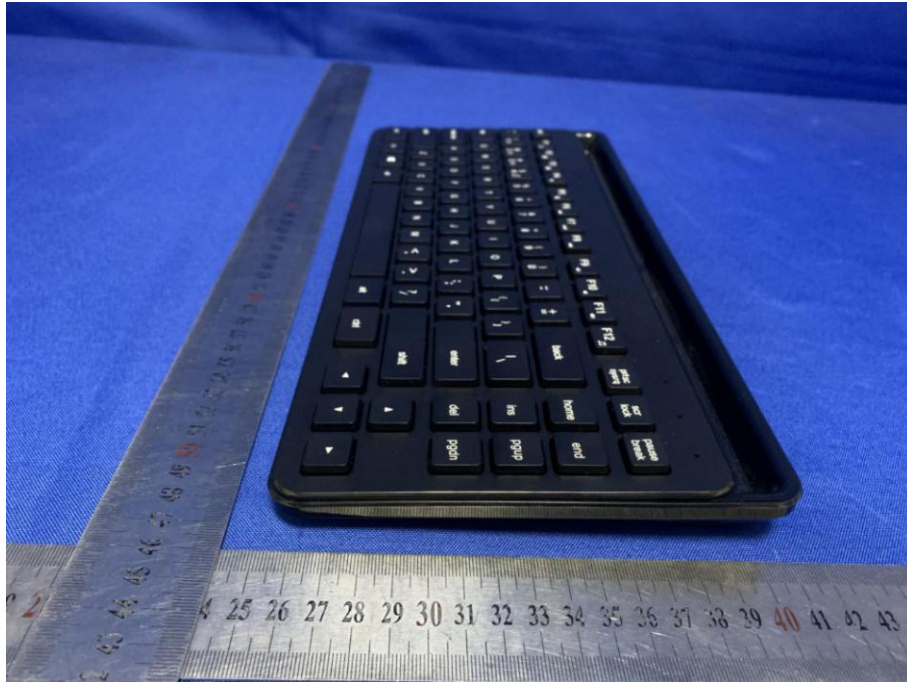
View of Product-3