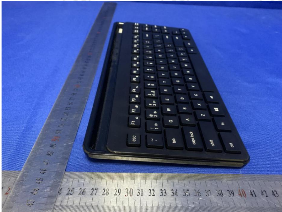
View of Product-5