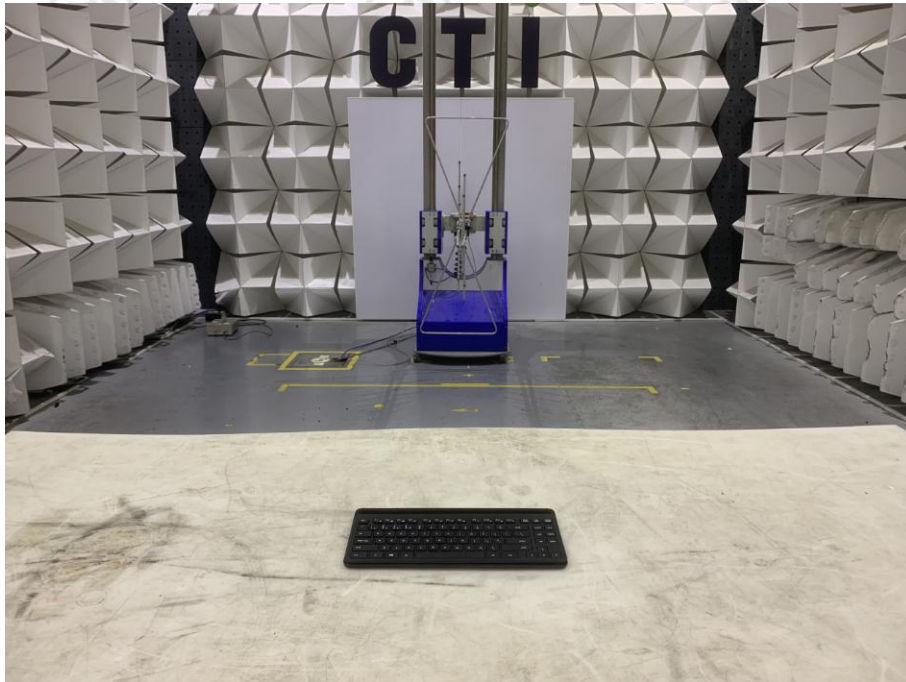
Radiated spurious emission Test Setup-1(Below 1GHz)