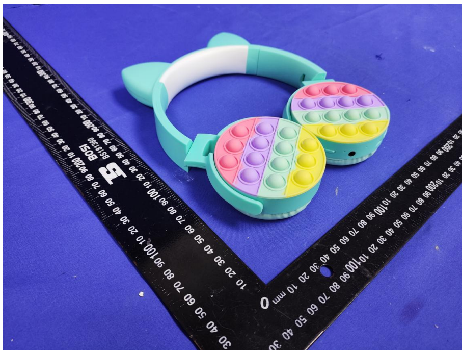
View of Product-2