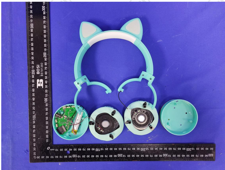
View of Product-6