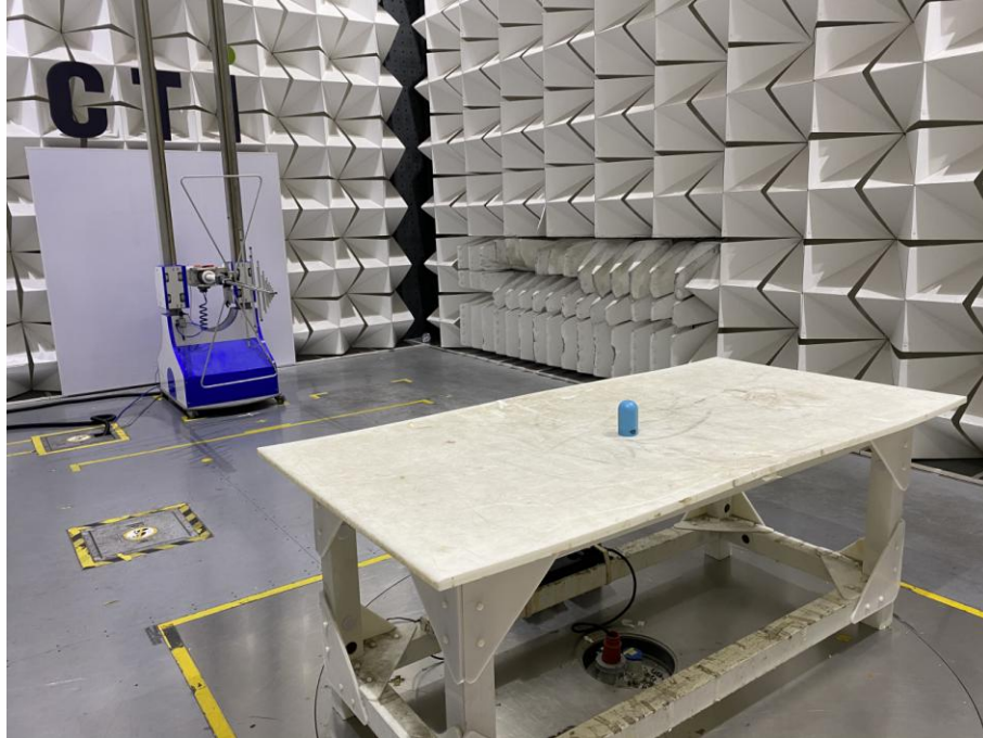
Radiated spurious emission Test Setup-1(Below 1GHz)