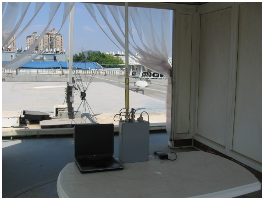
Radiated Emission Test, 30-200MHz