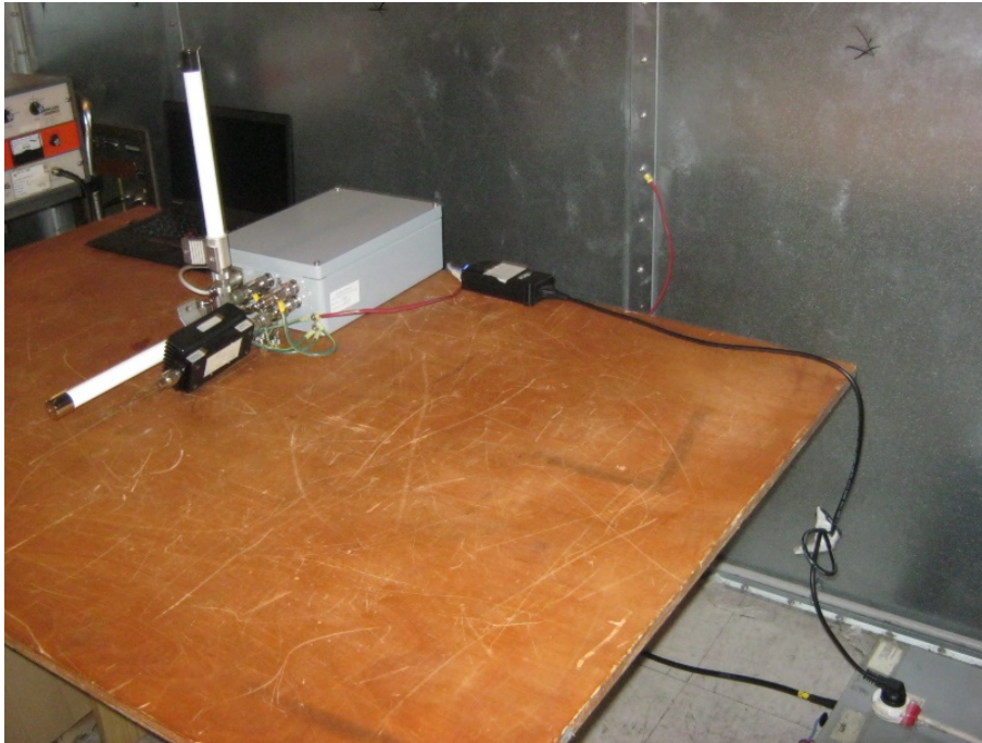
Conducted Emission from AC Mains Line Test