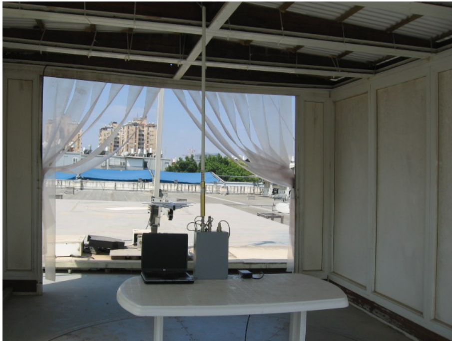
Radiated Emission Test, 200-1000MHz