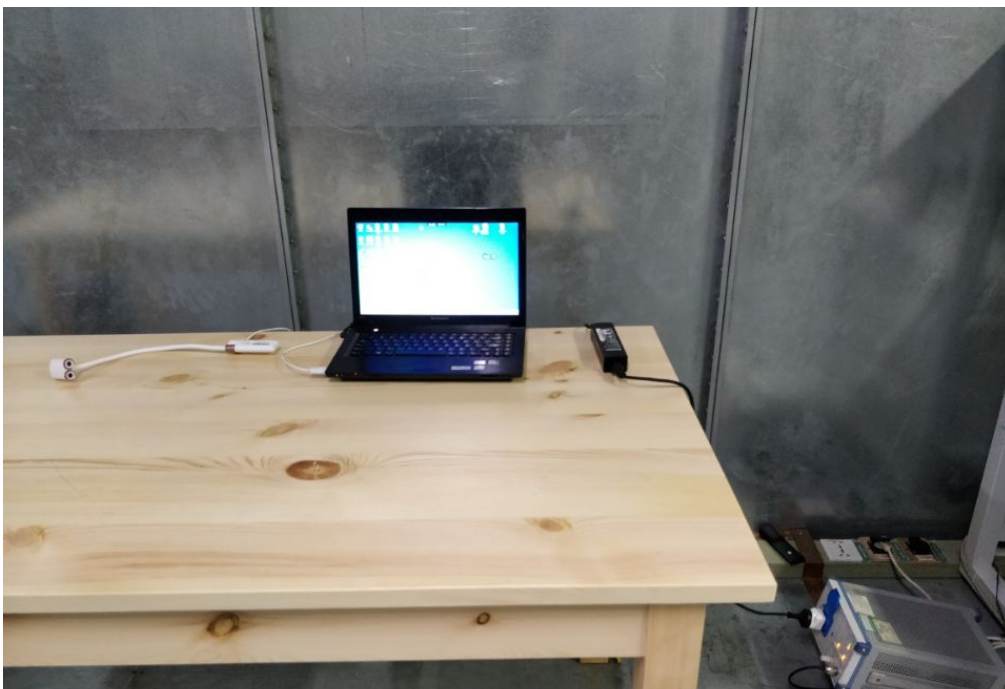
AC Conducted Emission of charge from PC mode