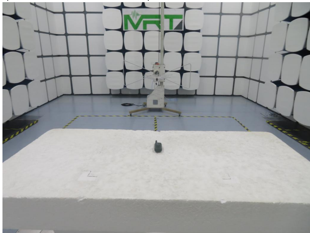
Description: Radiated Emission Test Setup for above 1GHz

Description: Radiated Emission Test Setup for below 1GHz