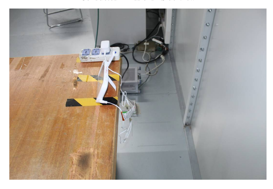
Page 1 of 2