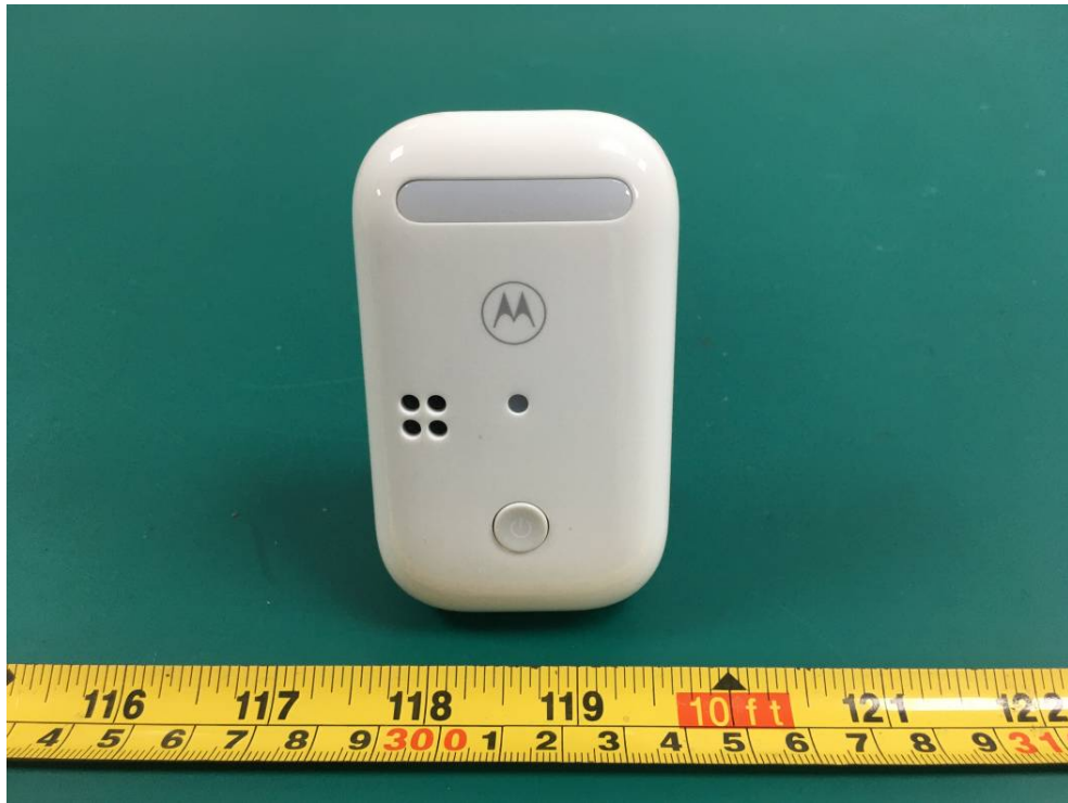
EXHIBIT B - EUT EXTERNAL PHOTOGRAPHS