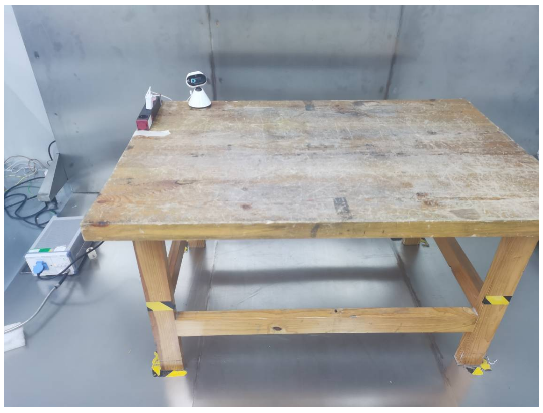
Conducted Emissions Front View (NBS10B050200VUU)