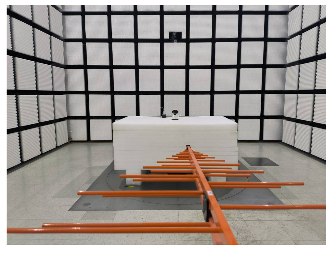
Radiated Emission Below 1GHz View (NBS10B050200VUU)

Radiated Emission Below 1GHz View (UT-681A-5200ZCY)