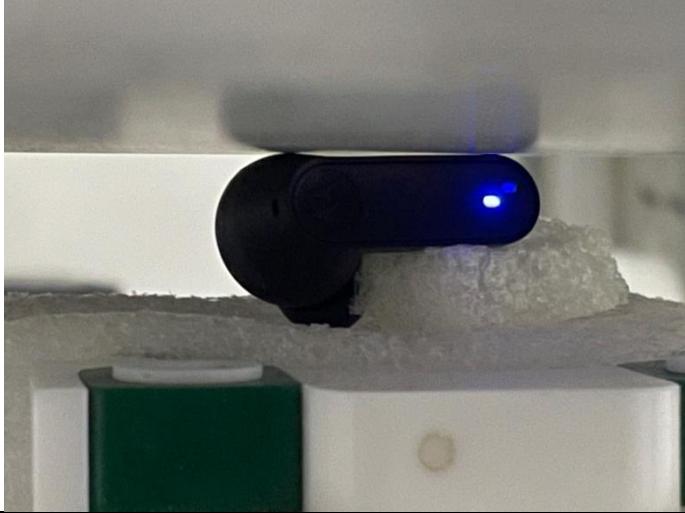
Left side (Separation distance of 0mm)