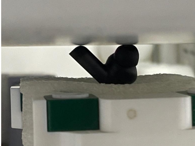
Front Side (Separation distance of 0mm)