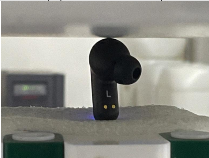
Top Side (Separation distance of 0mm)