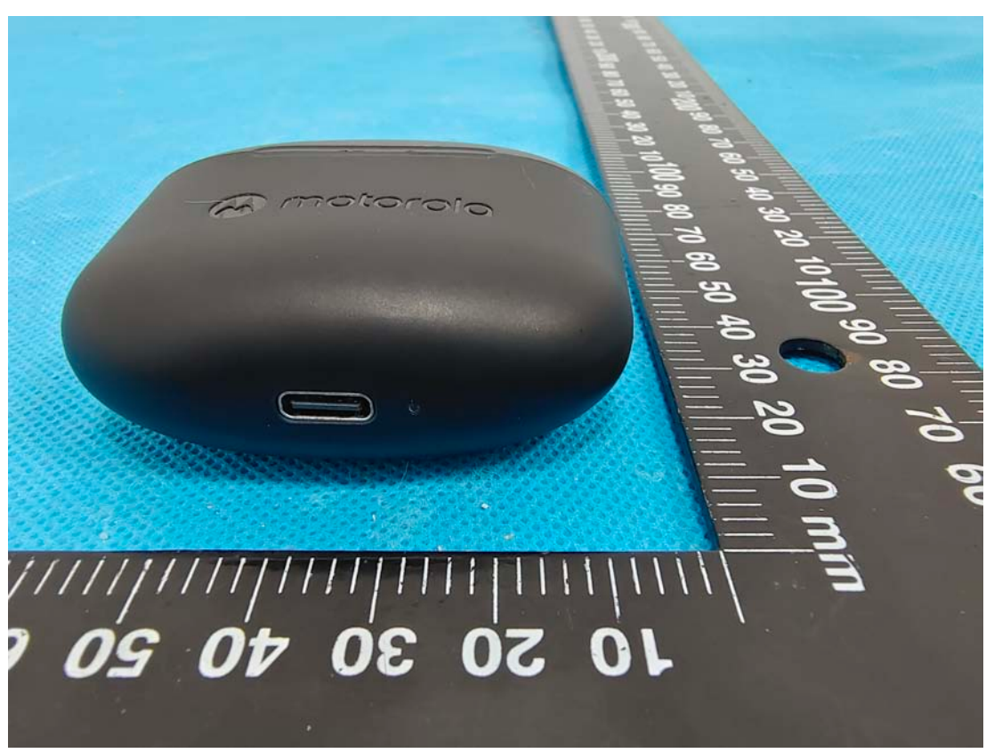
Page 3 of 8