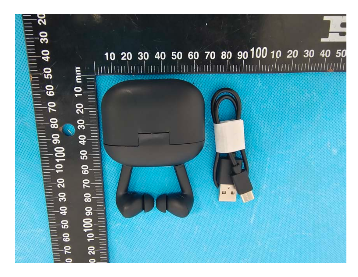
EXHIBIT B - EUT EXTERNAL PHOTOGRAPHS