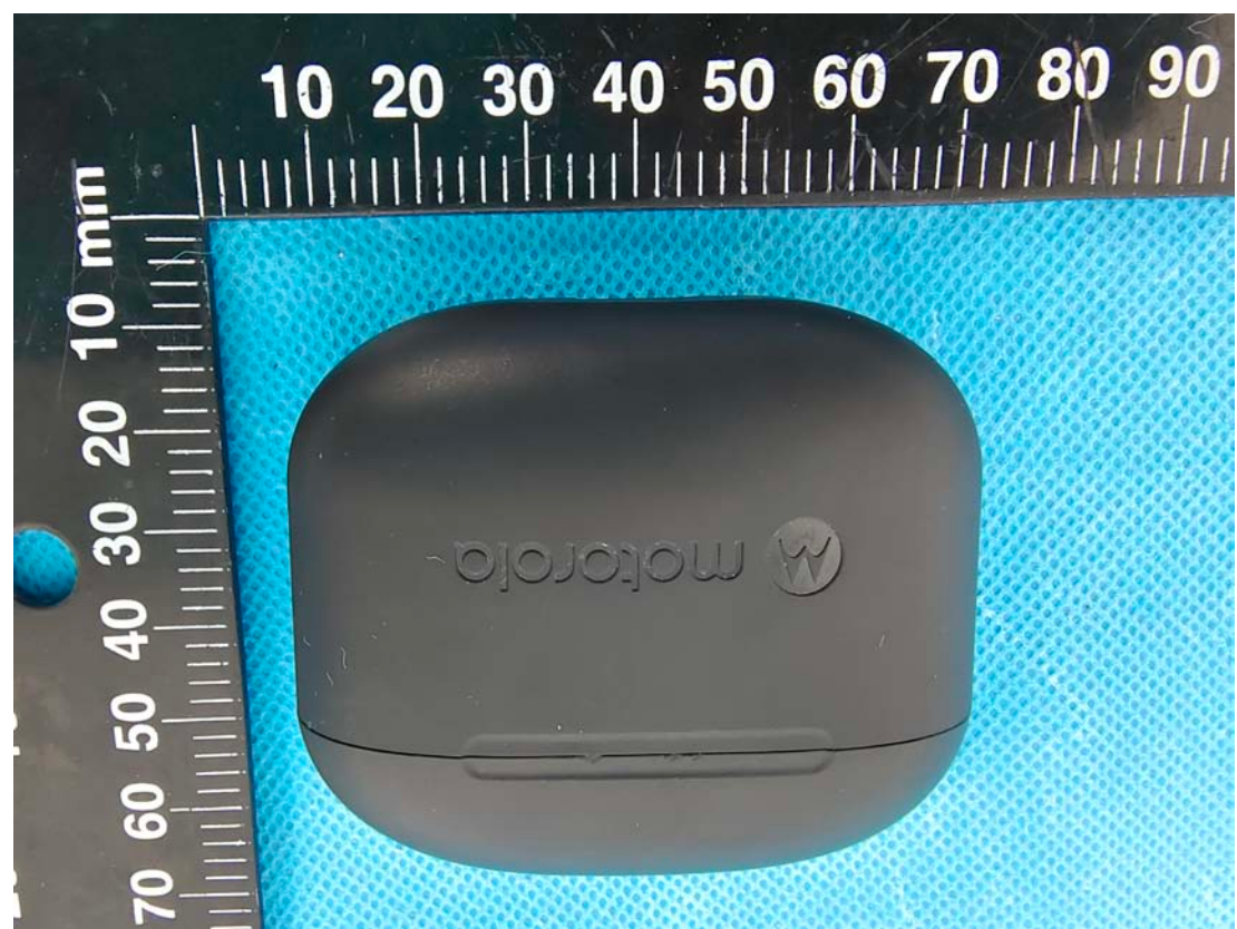
Page 1 of 8