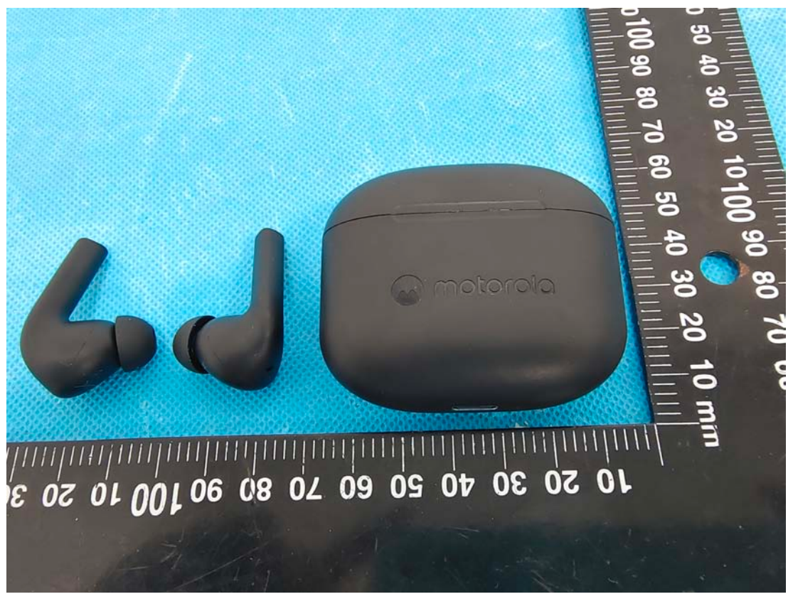
Page 4 of 8