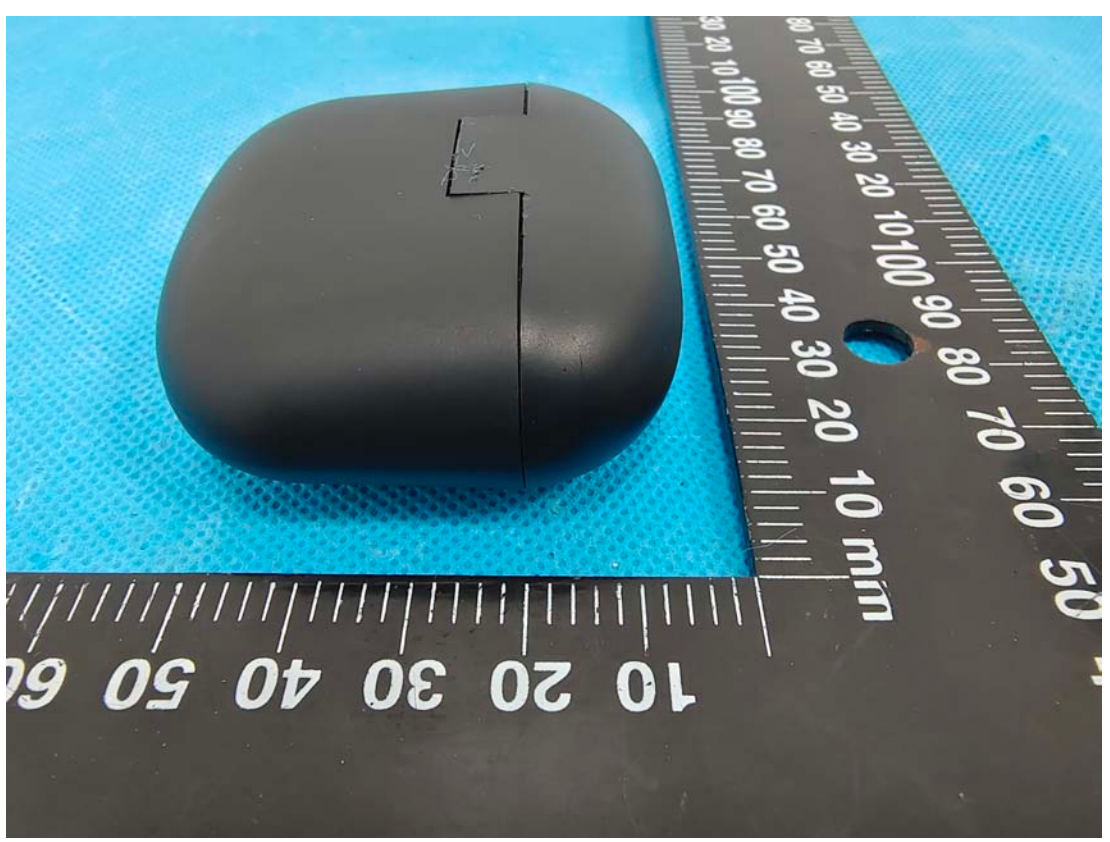
Page 2 of 8