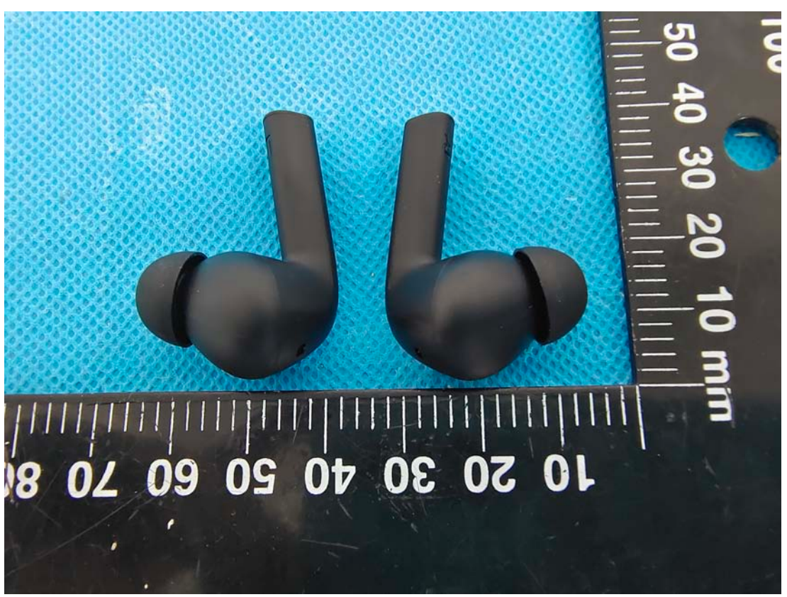
Page 7 of 8