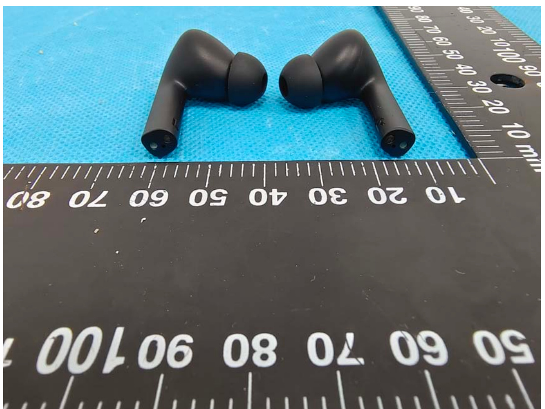
Page 6 of 8