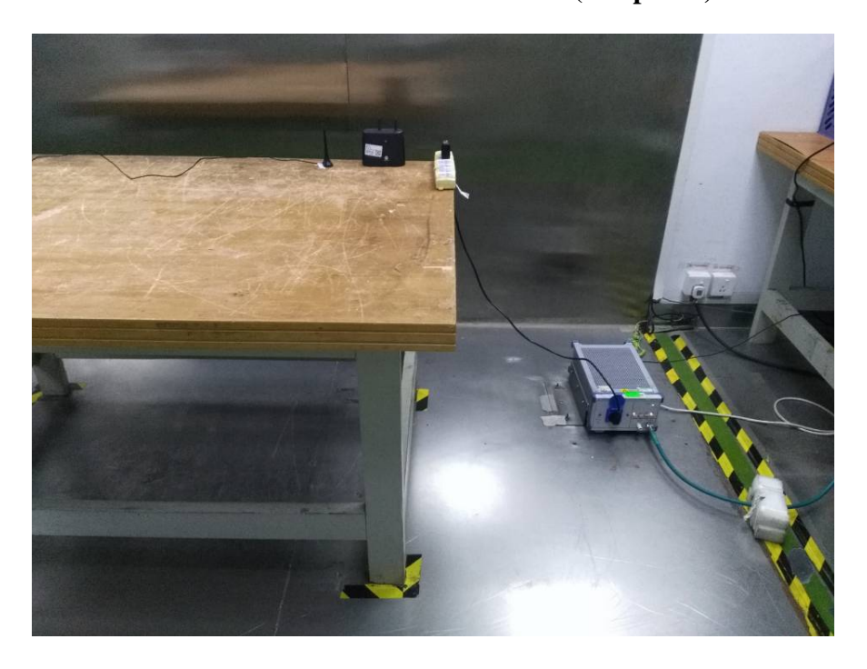
Conducted Emissions - Side View(Adapter 1)

Conducted\ Emissions-Front\ View (Adapter\ 1)