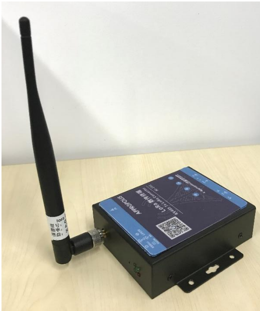
Figure 1 Antenna

The antenna is Reverse polarity Thread, Please rotate the antenna male onto the AI-101 and antenna must be placed perpendicular to the ground to