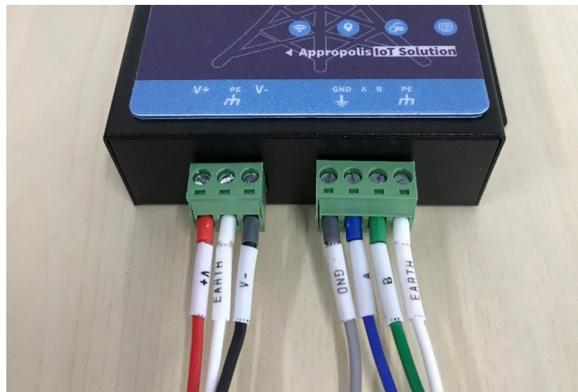
Figure 3 wires

Remove the industrial terminals on the DTU and loosen each hole with a screwdriver. The definition of each wire port is shown in the previous section. As show below, the three-wire terminal is the device power interface, and the four-wire is the RS485 data interface.