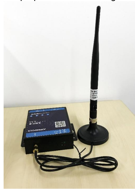
Figure 2 Antenna with extension wire