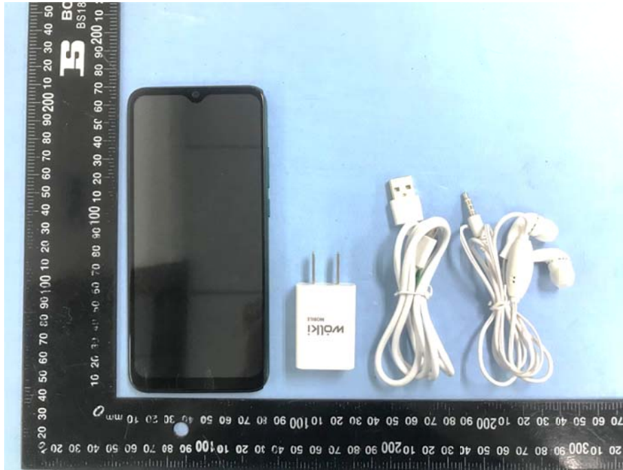
EUT View 2