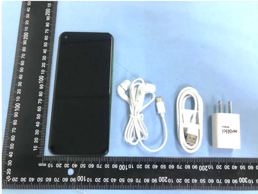
EUT View 2