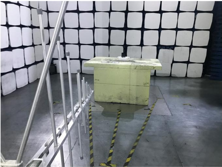
Radiation Emission Test Setup (1GHz to 18GHz)