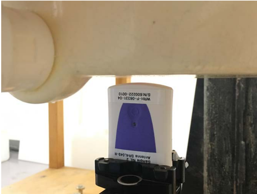
Figure 1 – Bottom side with 5mm Separation