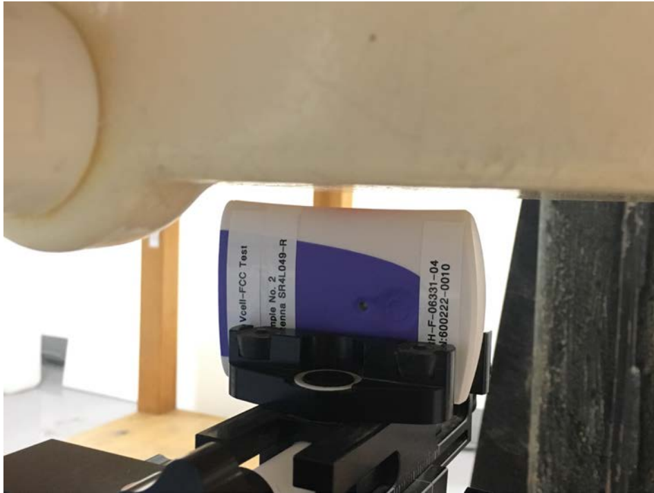
Figure 3 – Right side with 5mm Separation