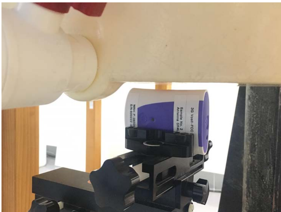
Figure 4 – Left side with 5mm Separation