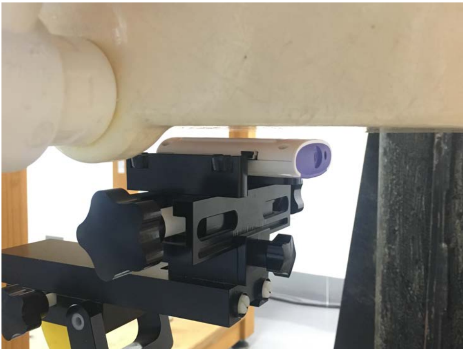
Figure 2 – Rear surface with 5mm Separation