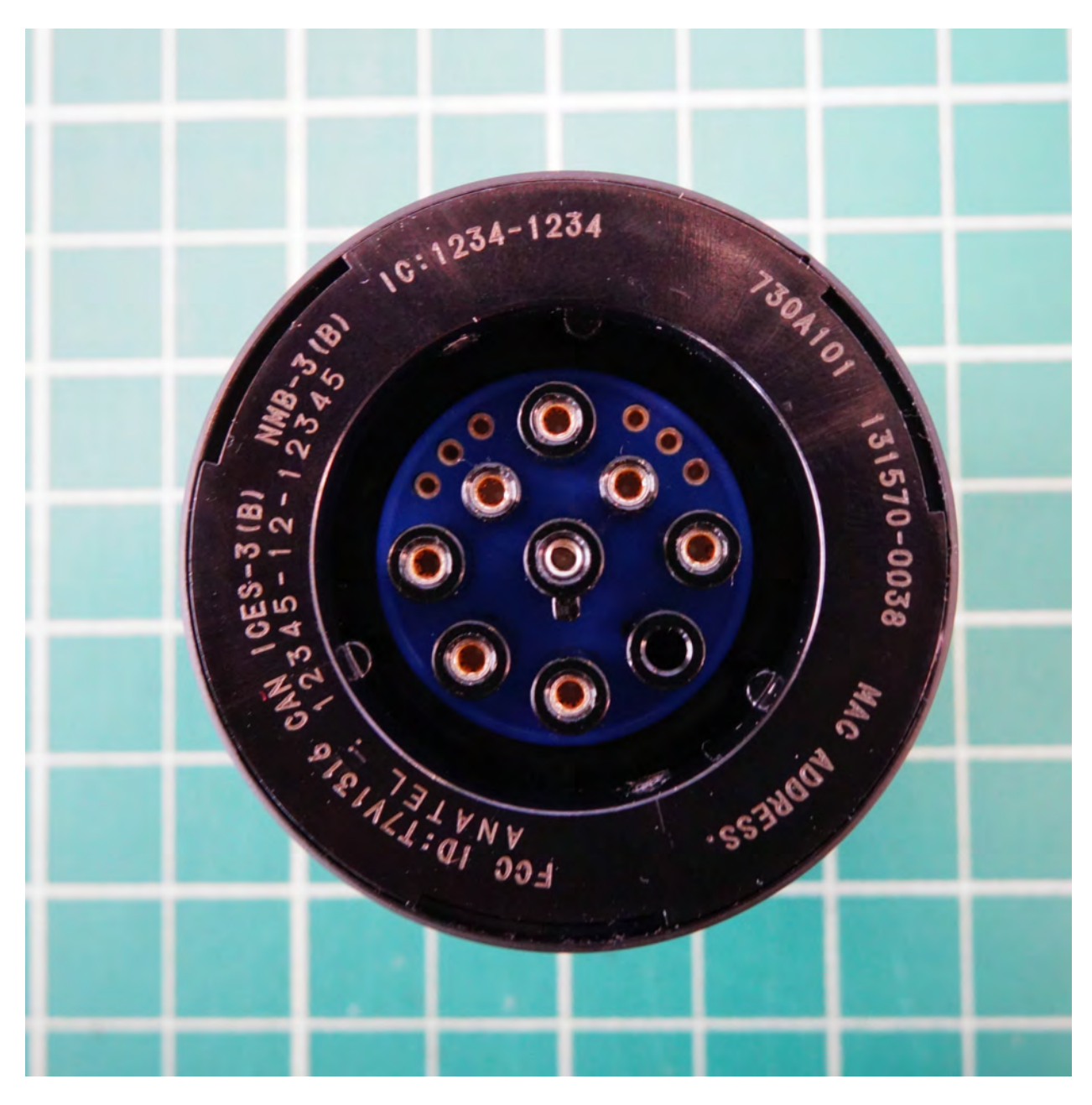
Picture 3 - Detailed view of FieldView Drive 2 enclosure bottom, including view of the J1939 connector and prototype markings. These markings do not reflect what will be used on the final product.