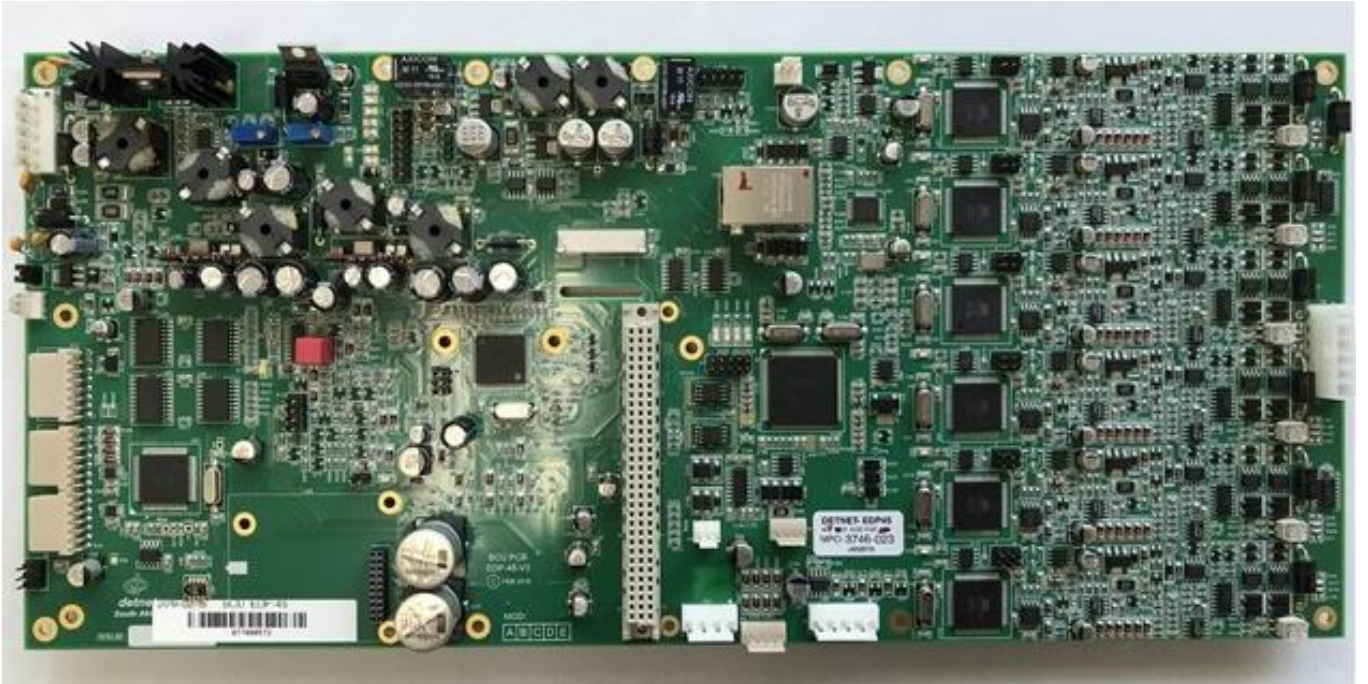
Photo 6 Bottom view of RF Board