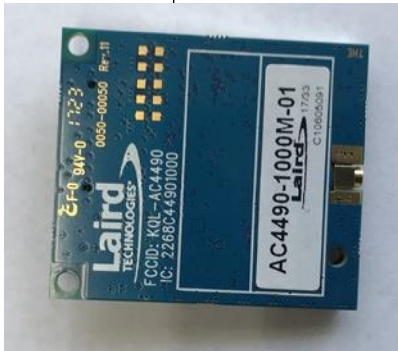
Photo 4 Bottom view of RF module