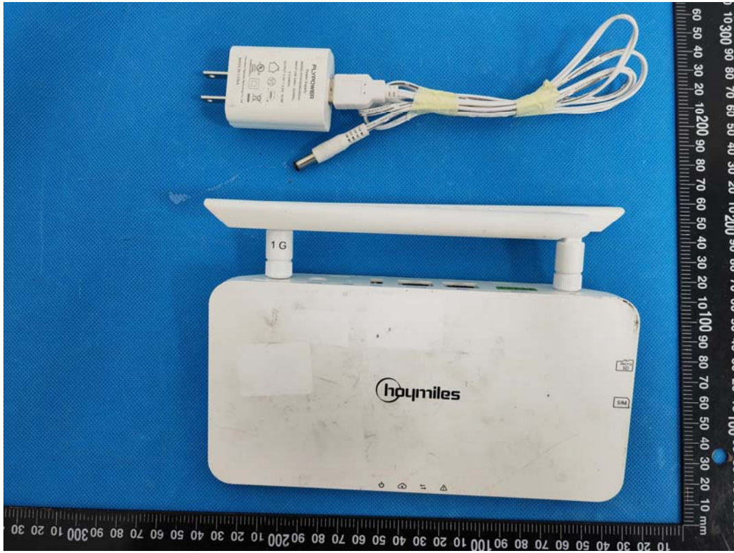
EXHIBIT B - EUT EXTERNAL PHOTOGRAPHS