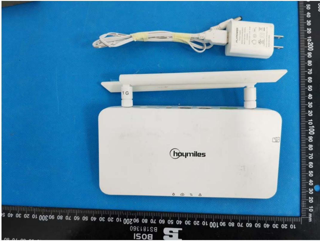
EXHIBIT B - EUT EXTERNAL PHOTOGRAPHS