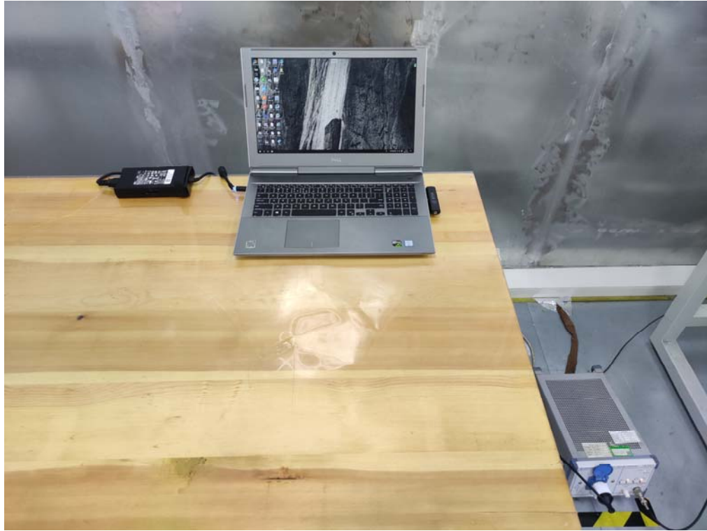
Power Line Conducted Emission