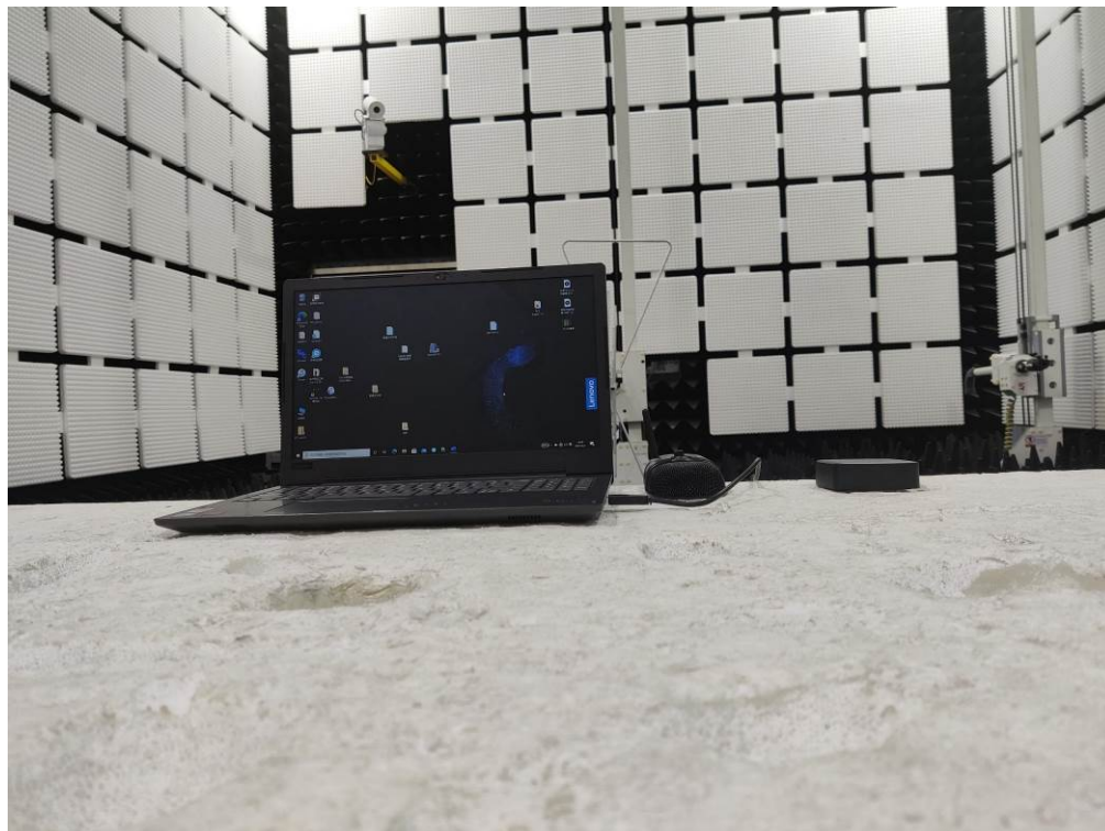
Below 1 GHz