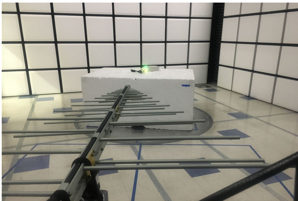
RF Radiated Above 1 GHz