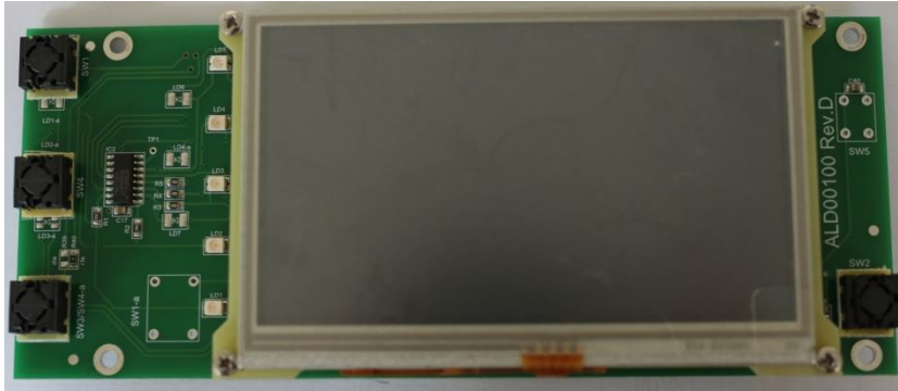
2.6 RF amplifier board