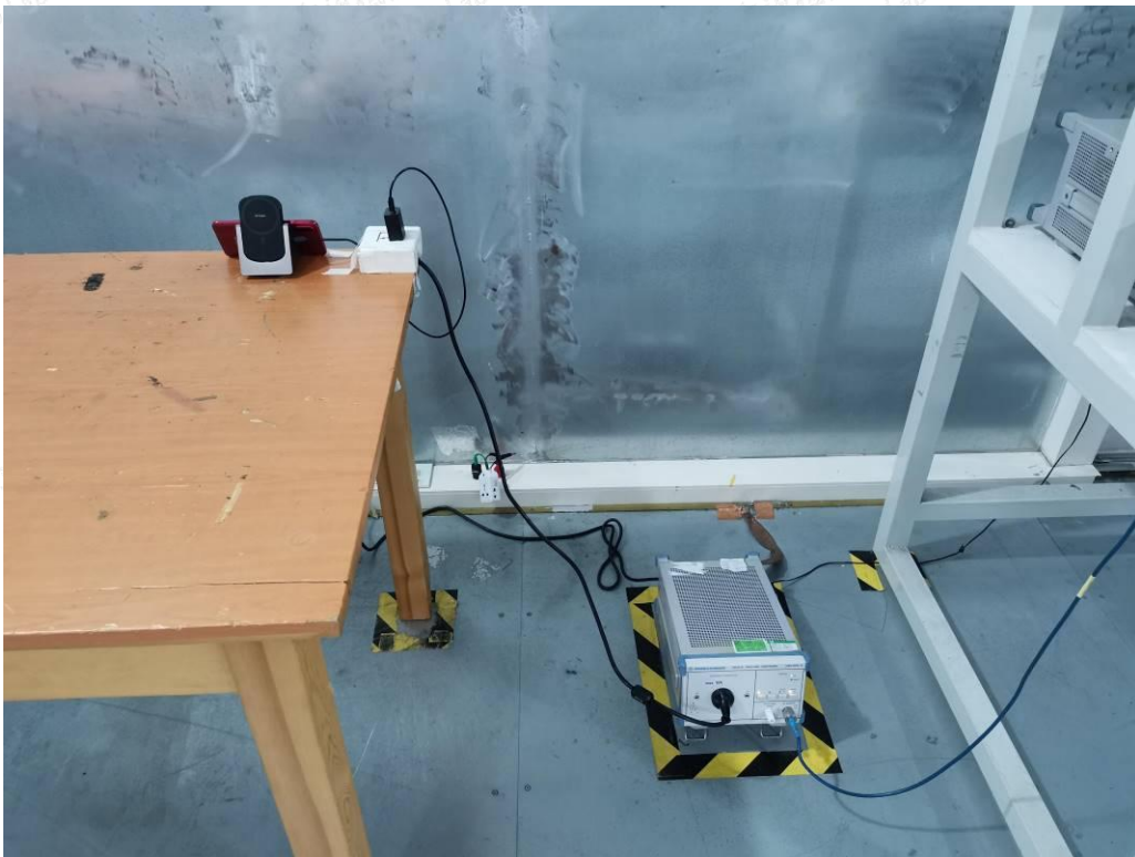
Conducted Emission-AC adapter charge mode