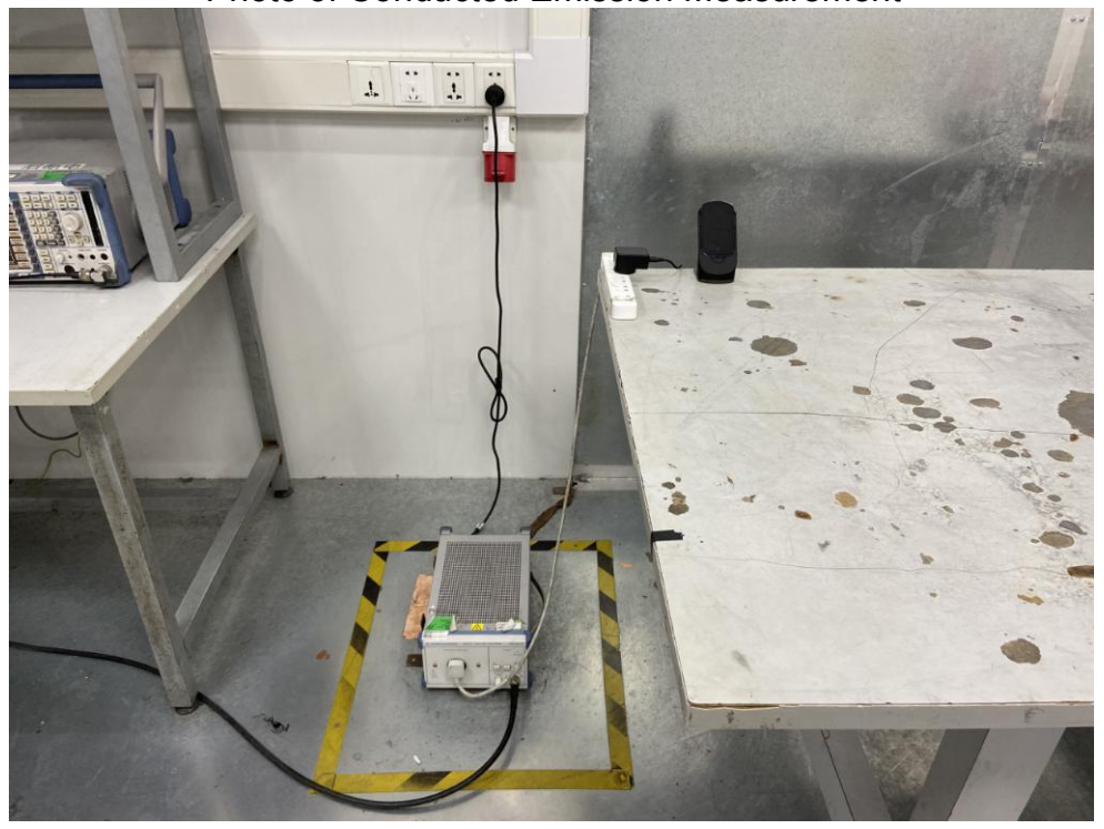
FCC ID: 2ARI5-MJ2-01 Photo of Conducted Emission Measurement