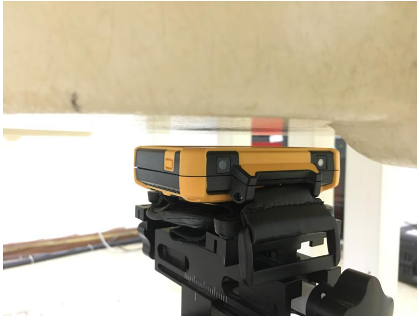
Next to mouth

(Test distance: 10mm, Thickness of DUT: 26mm)