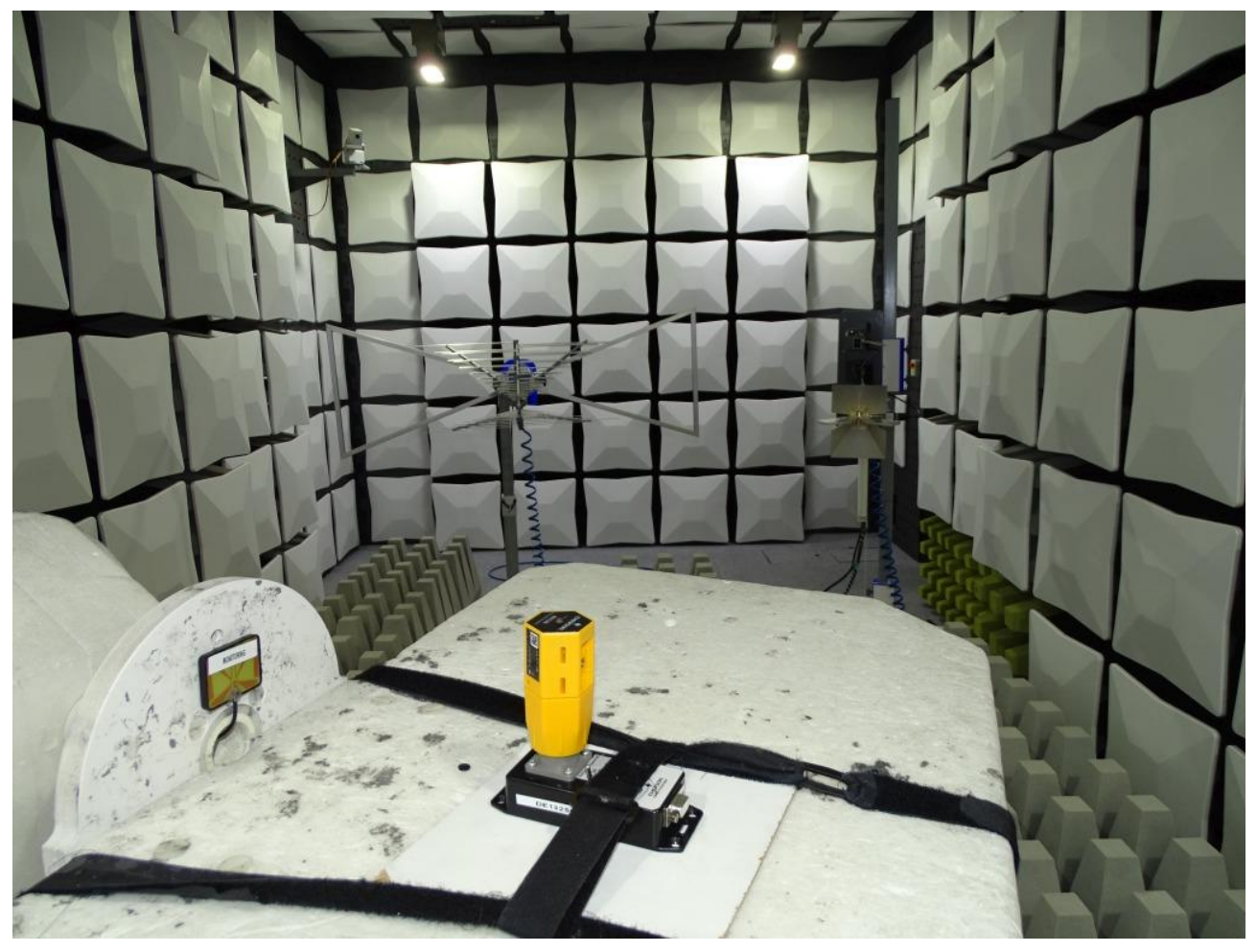
Photo 6: Test setup for radiated measurements above 1 GHz, detailed view