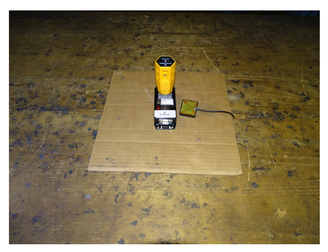
Photo 2: Test setup for radiated measurements below 1 GHz, detailed view, Front side