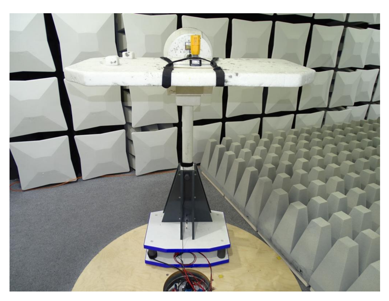
Photo 4: Test setup for radiated measurements above 1 GHz, right side view