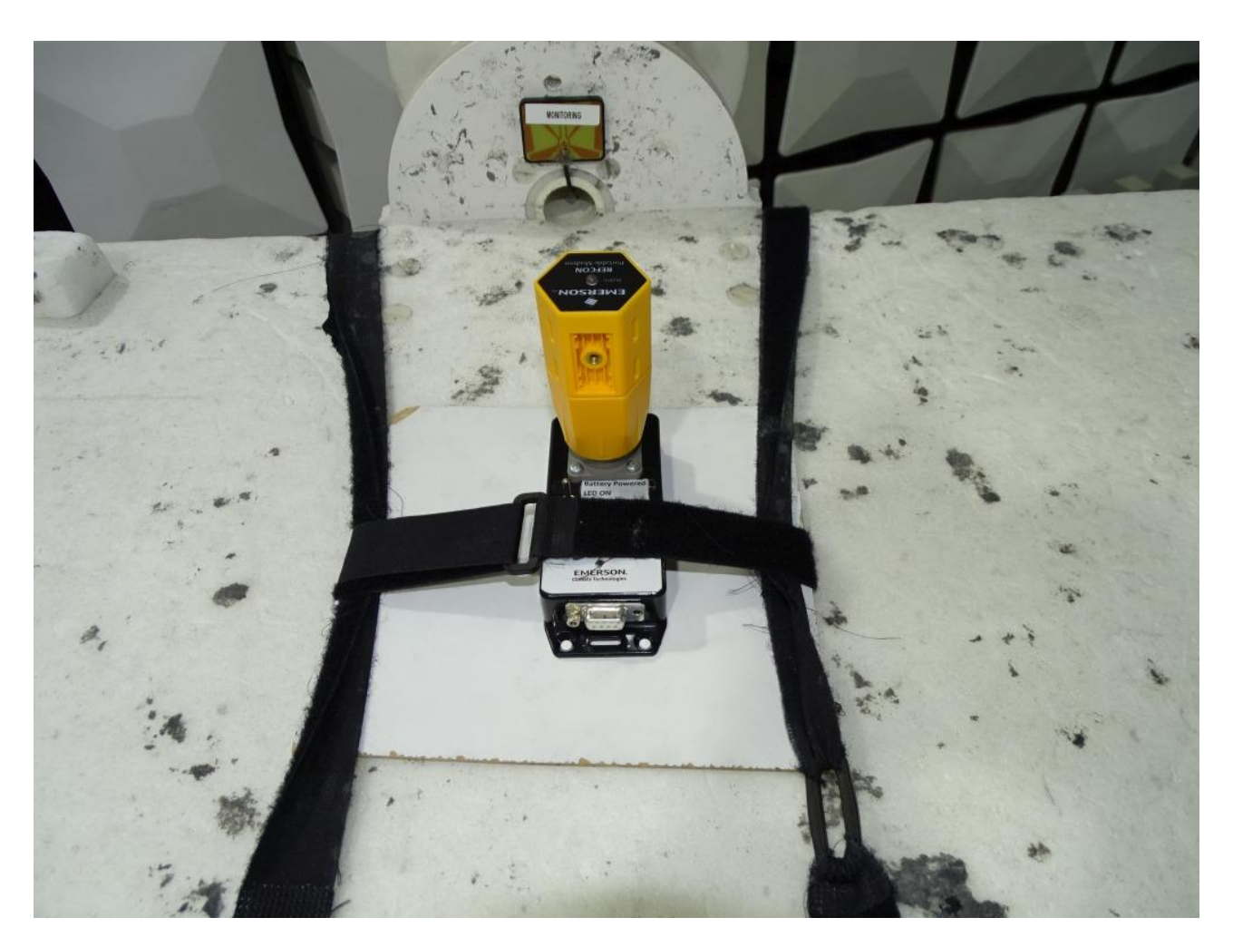
Photo 5: Test setup for radiated measurements above 1 GHz, detailed view