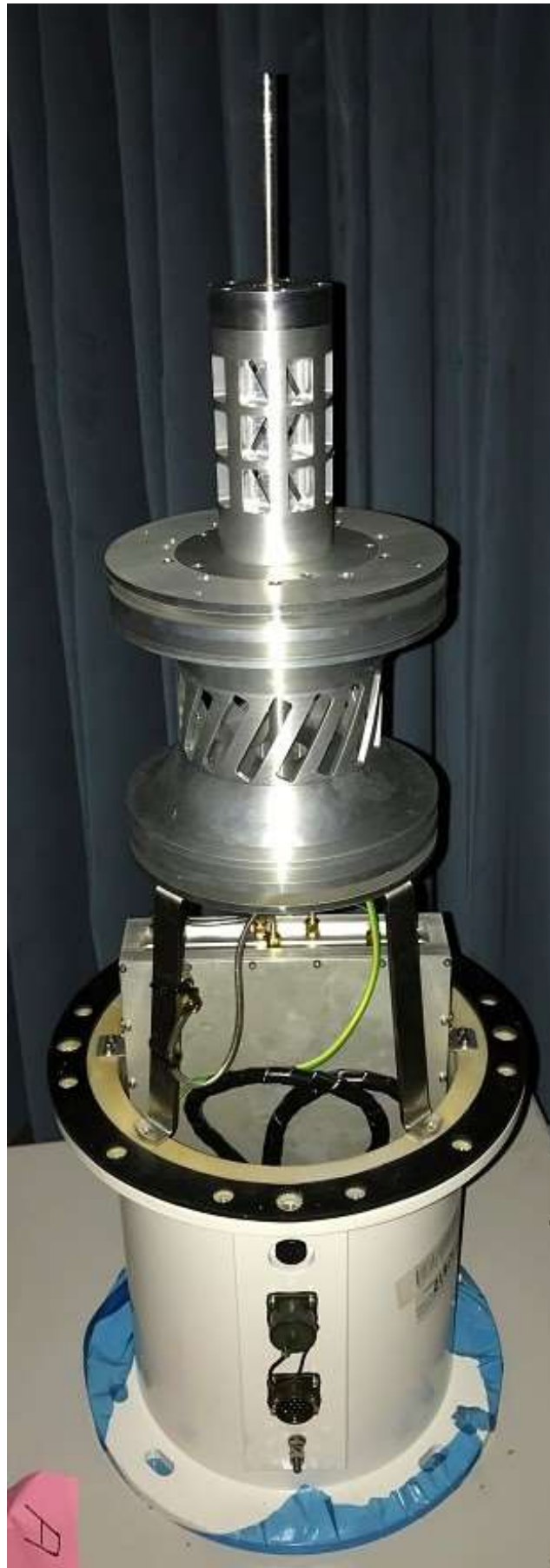
Dome Removed, Antenna and Main Shielded Enclosure Revealed, Side 3 of 4