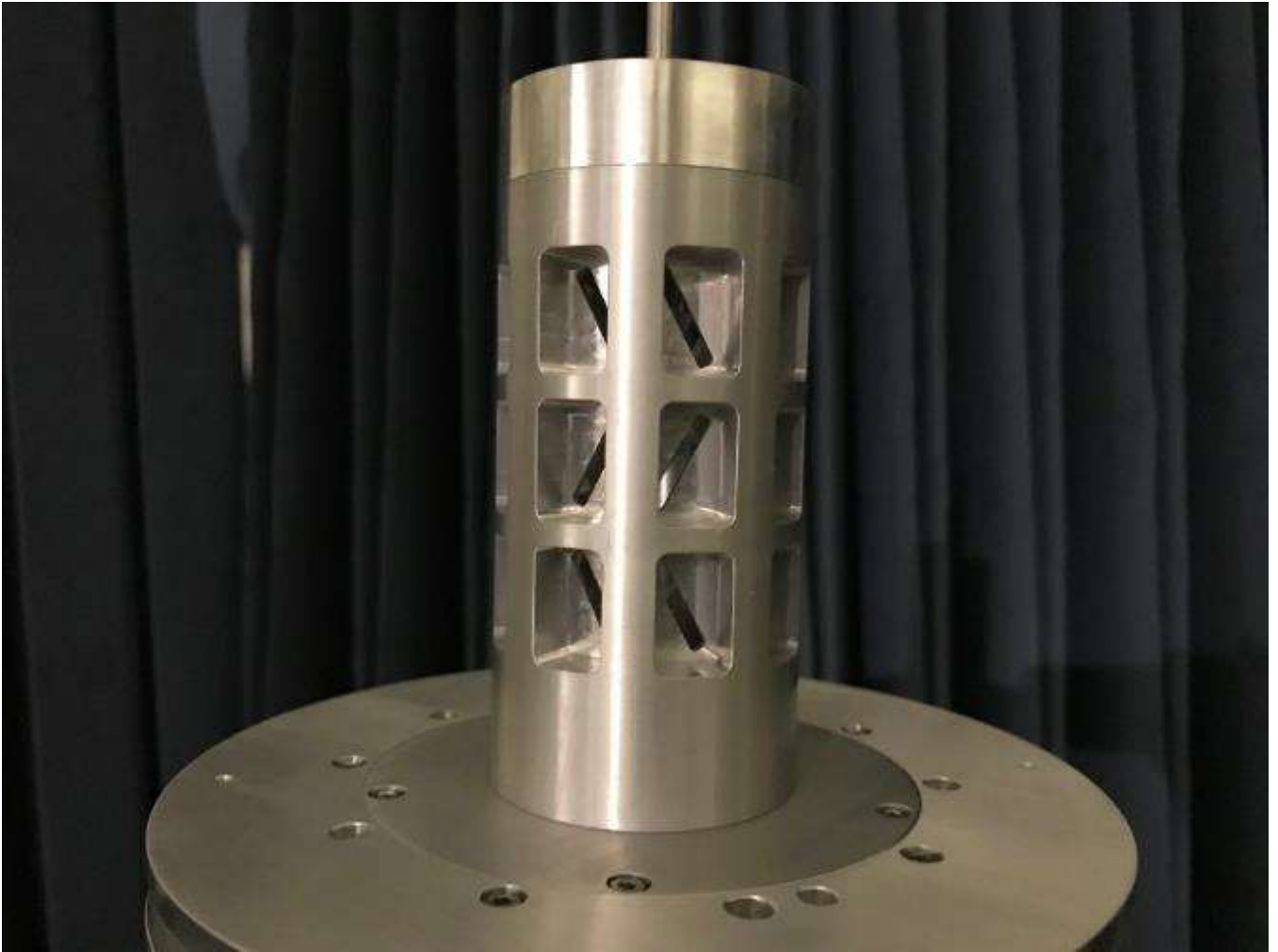
X-Band Antenna, Omnidirectional Slot Array