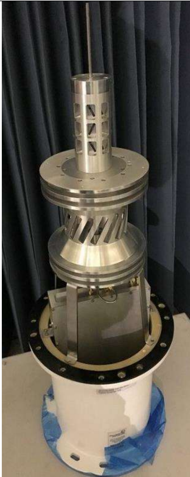
Dome Removed Views

Antennas and Main Shielded Enclosure Revealed, Side 1 of 4