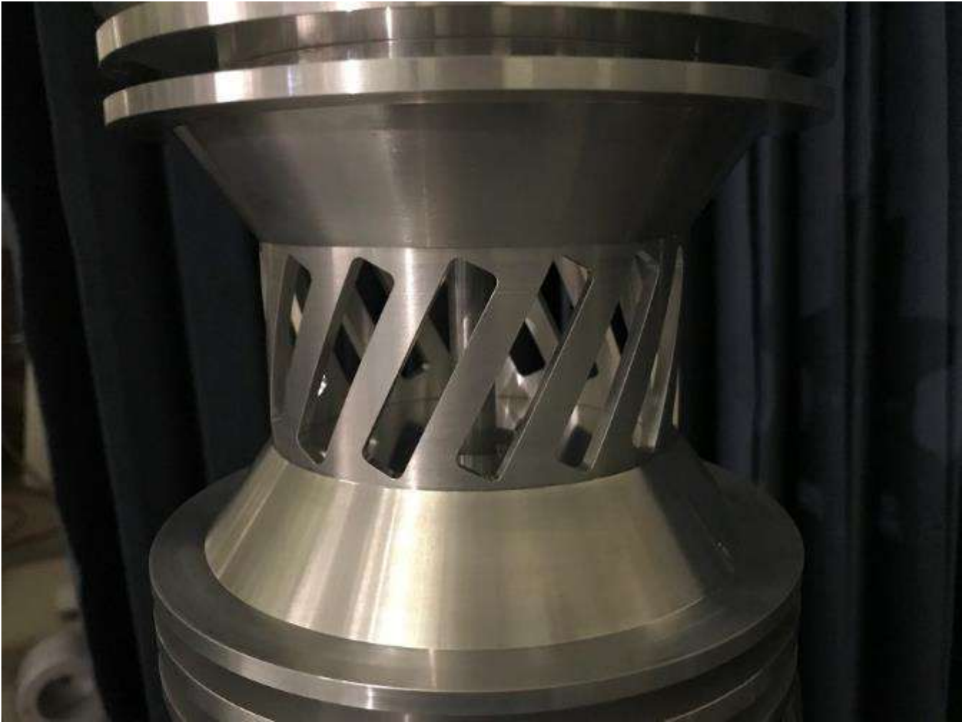
S-Band Antenna, Omnidirectional Slot Array