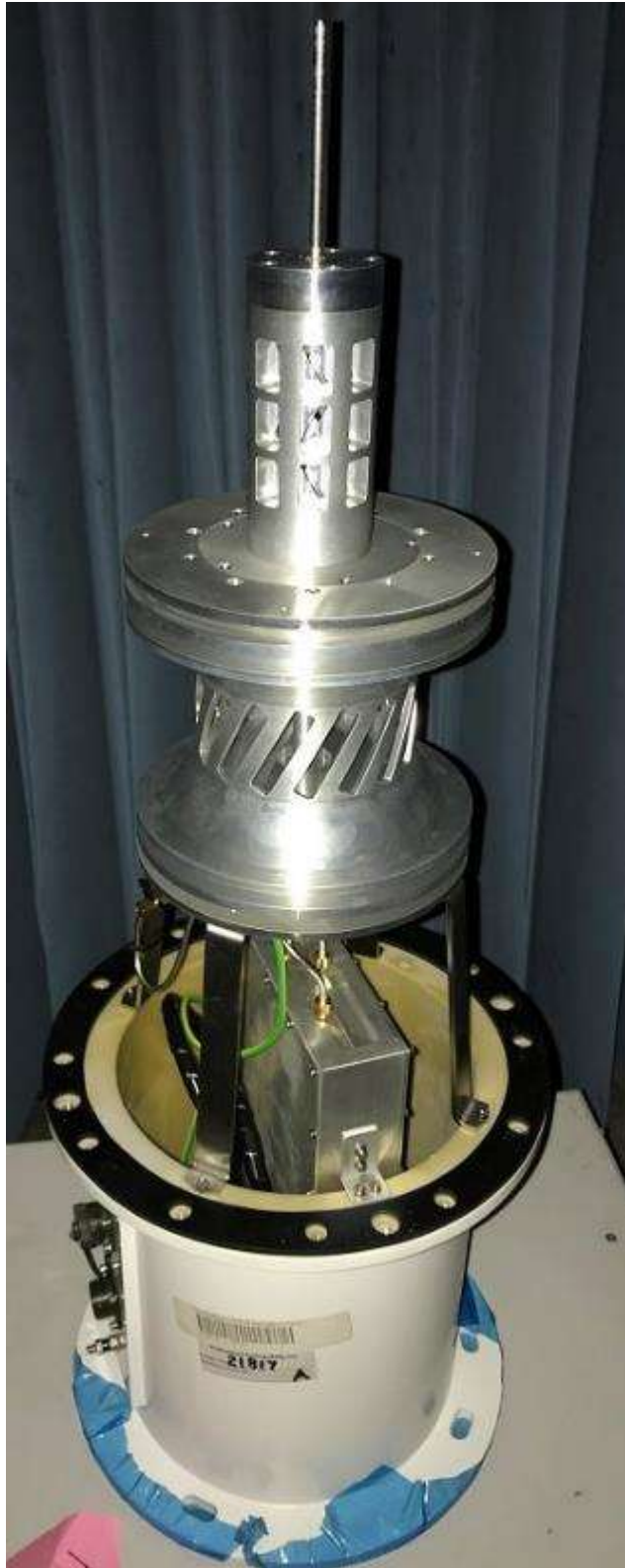
Dome Removed, Antenna and Main Shielded Enclosure Revealed, Side 2 of 4