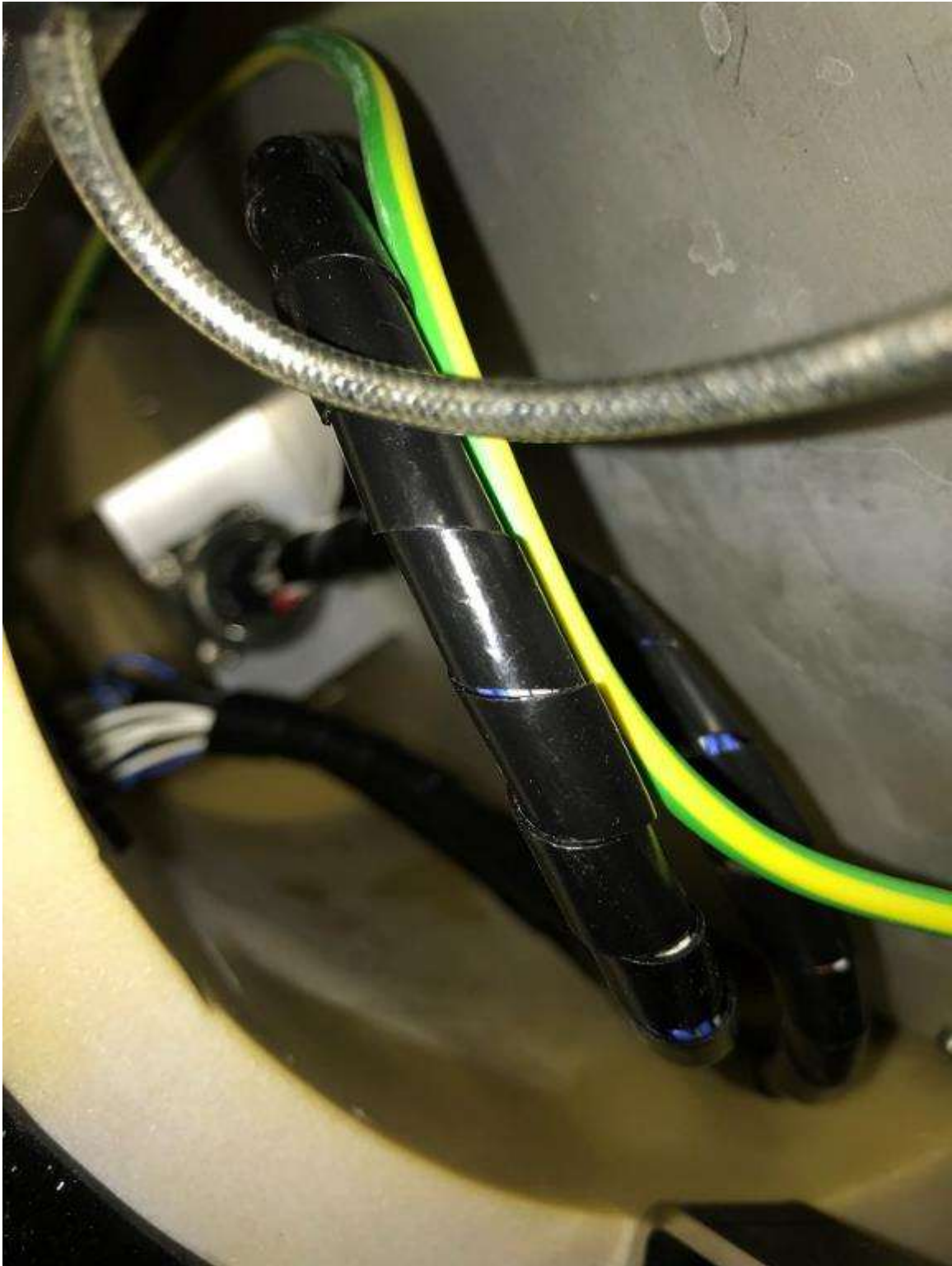
Wiring, power and I/O, side of main enclosure, with earth/grounding cable.