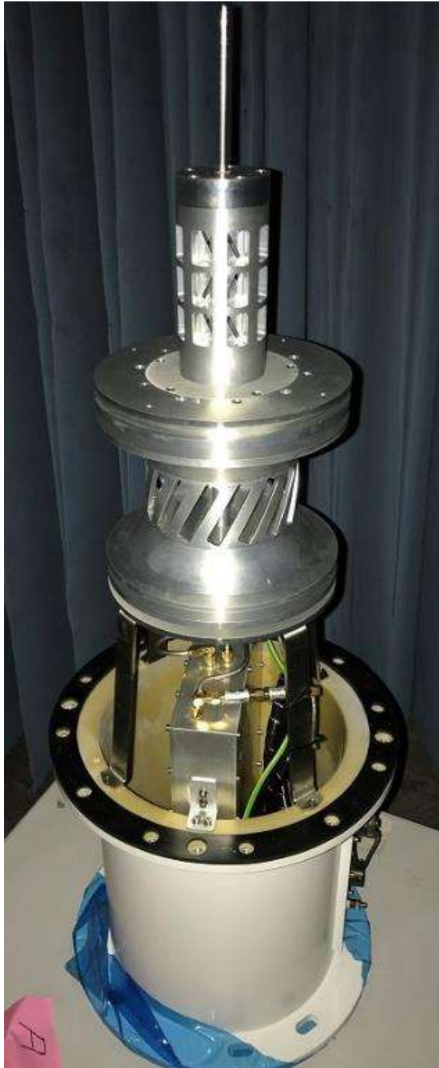
Dome Removed, Antenna and Main Shielded Enclosure Revealed, Side 4 of 4