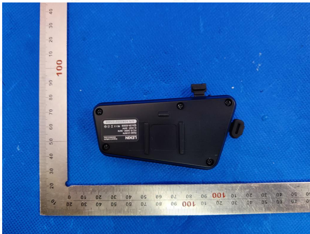
FRONT VIEW OF EUT