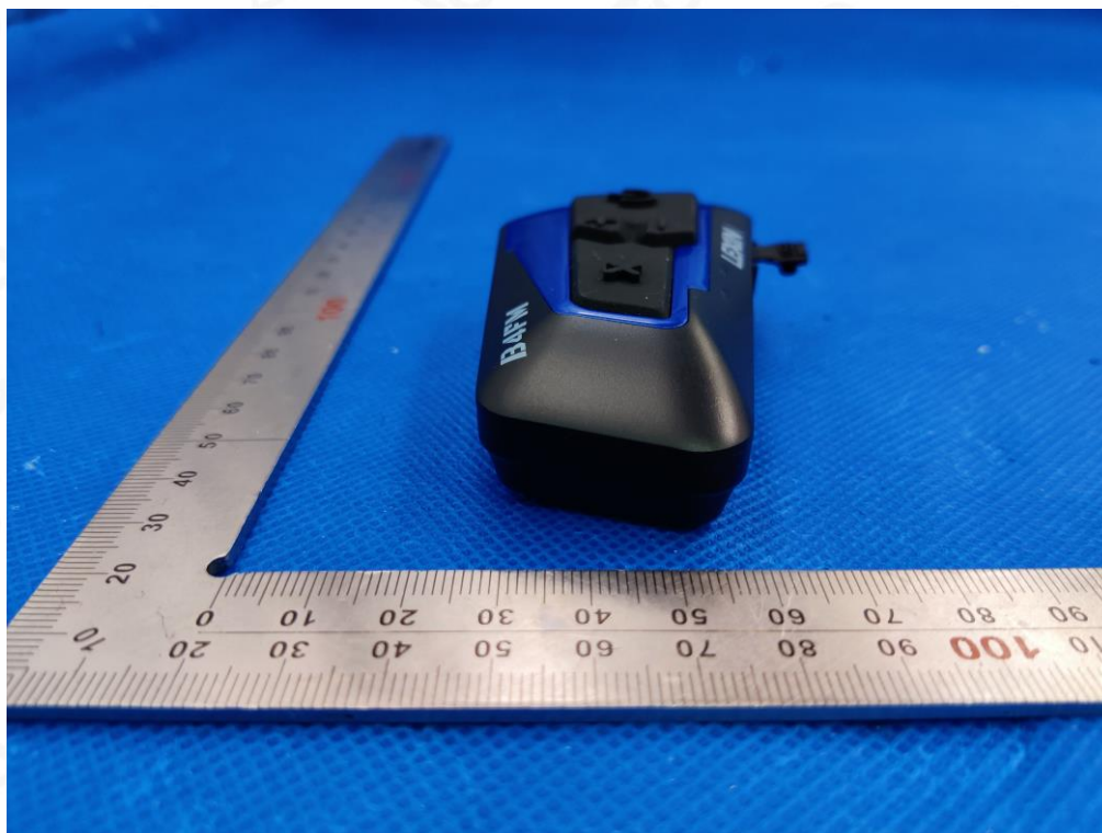
PORT VIEW OF EUT-1