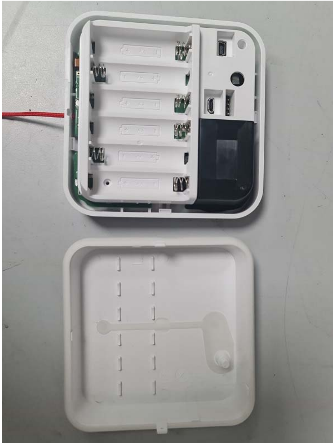
Photograph No.1 ES700VPD2-US-M01 general internal view