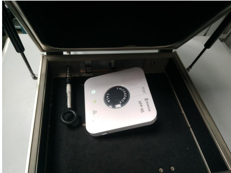
Photograph 1 Setup for OBW measurements