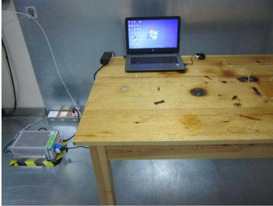
DTS radiation L