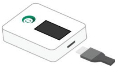
(Recommended: 5.0 V, Max 1.0 Amp)

Connect your device to any USB Charging port using the cable provided. You can view the charging status on the screen of your Golfication X.