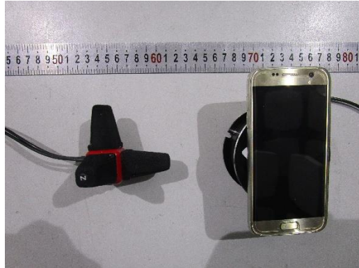
Probe Position Rear