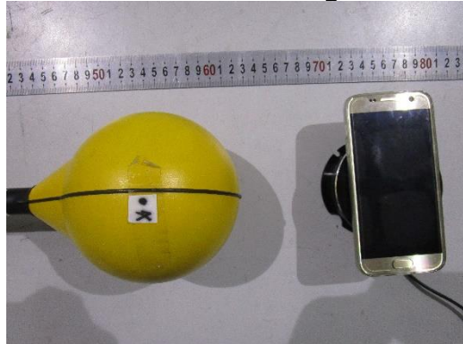
Probe Position Right