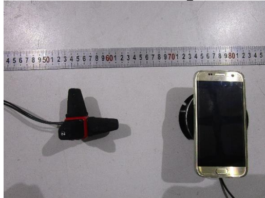
Probe Position Right