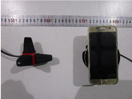
Probe Position Left