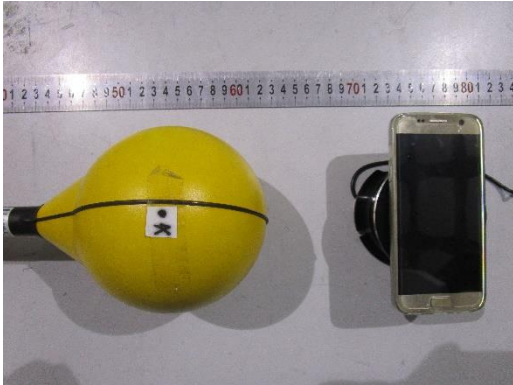
Probe Position Front