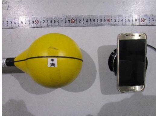
Probe Position Rear