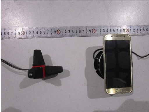
Probe Position Front