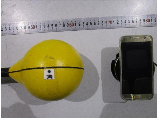
Probe Position Left