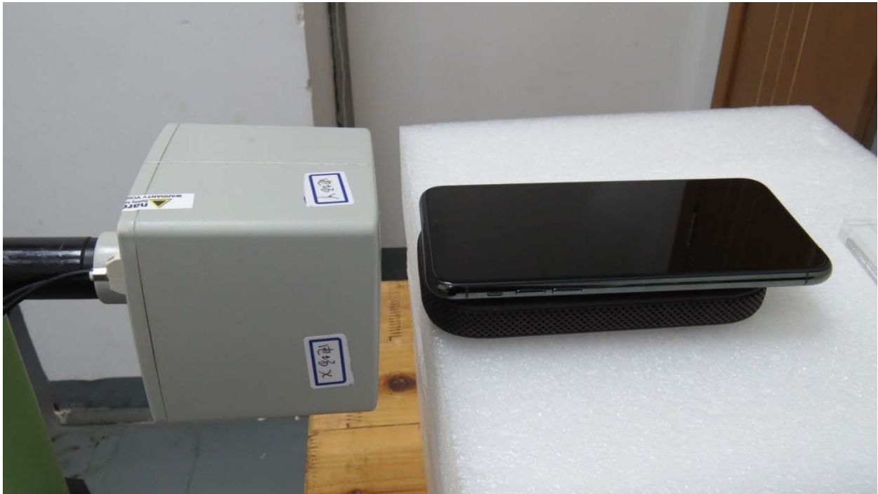
Picture 11: Top Side, the distance from EUT to the bottom of the Phantom is 15mm