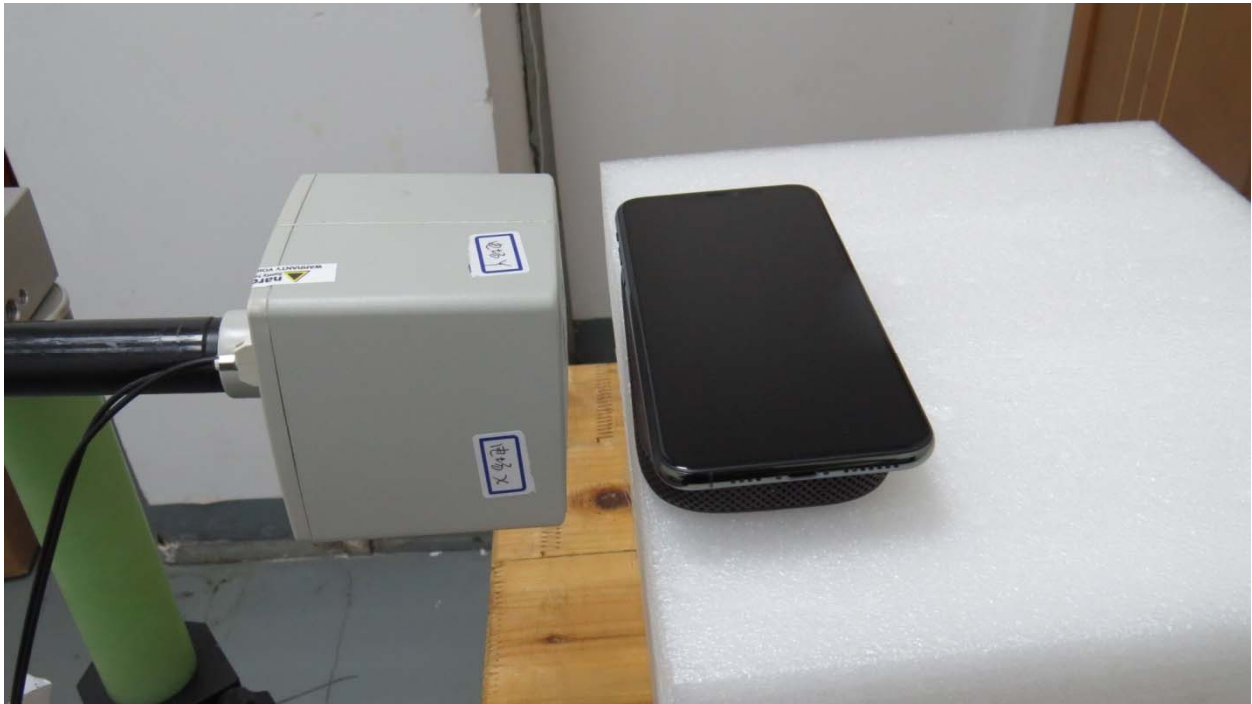
Picture 9: Left Side, the distance from EUT to the bottom of the Phantom is 15mm