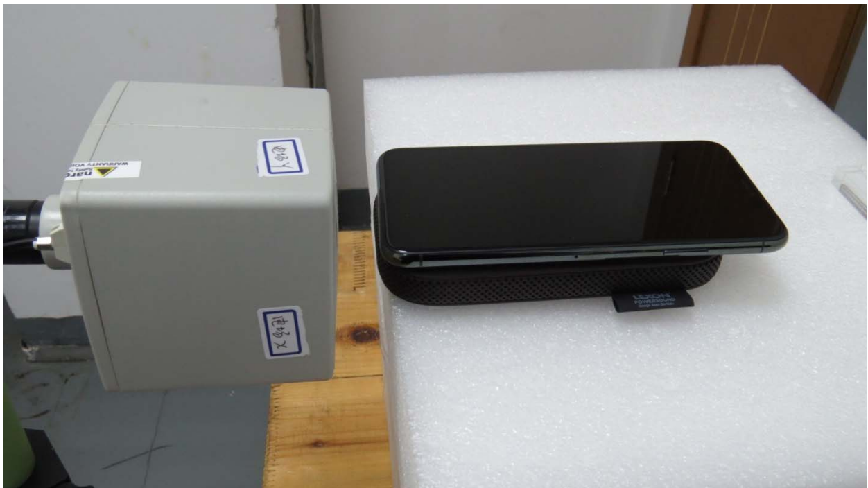
Picture 12: Bottom Edge, the distance from EUT to the bottom of the Phantom is 15mm