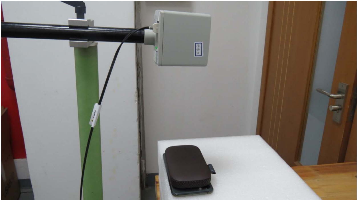
Picture 1: Back Side, the distance from EUT to the bottom of the Phantom is 20cm