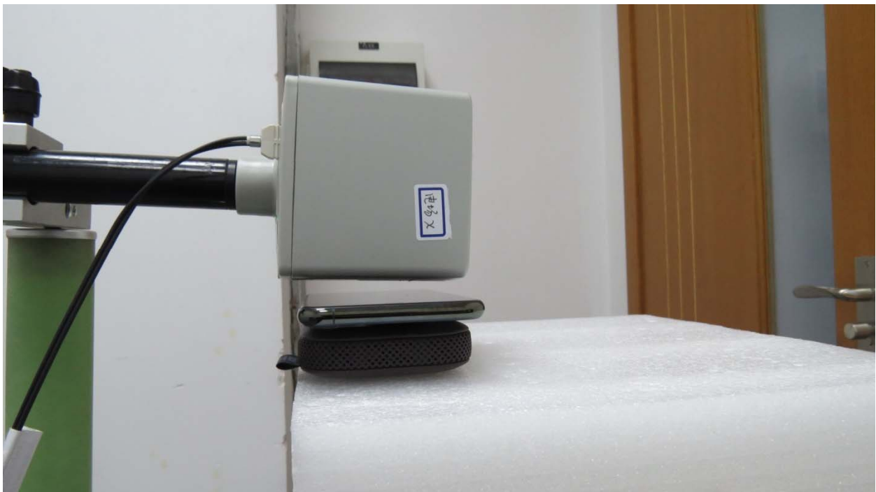
Picture 8: Front Side, the distance from EUT to the bottom of the Phantom is 15mm