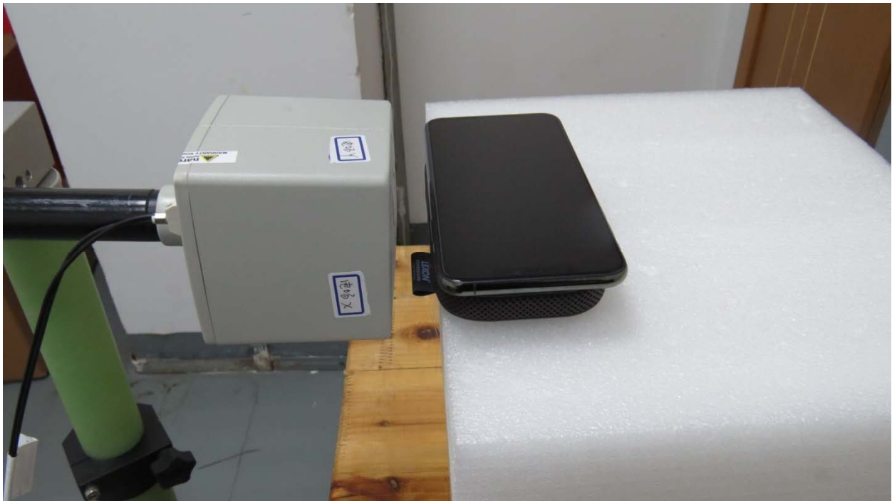
Picture 10: Right Side, the distance from EUT to the bottom of the Phantom is 15mm