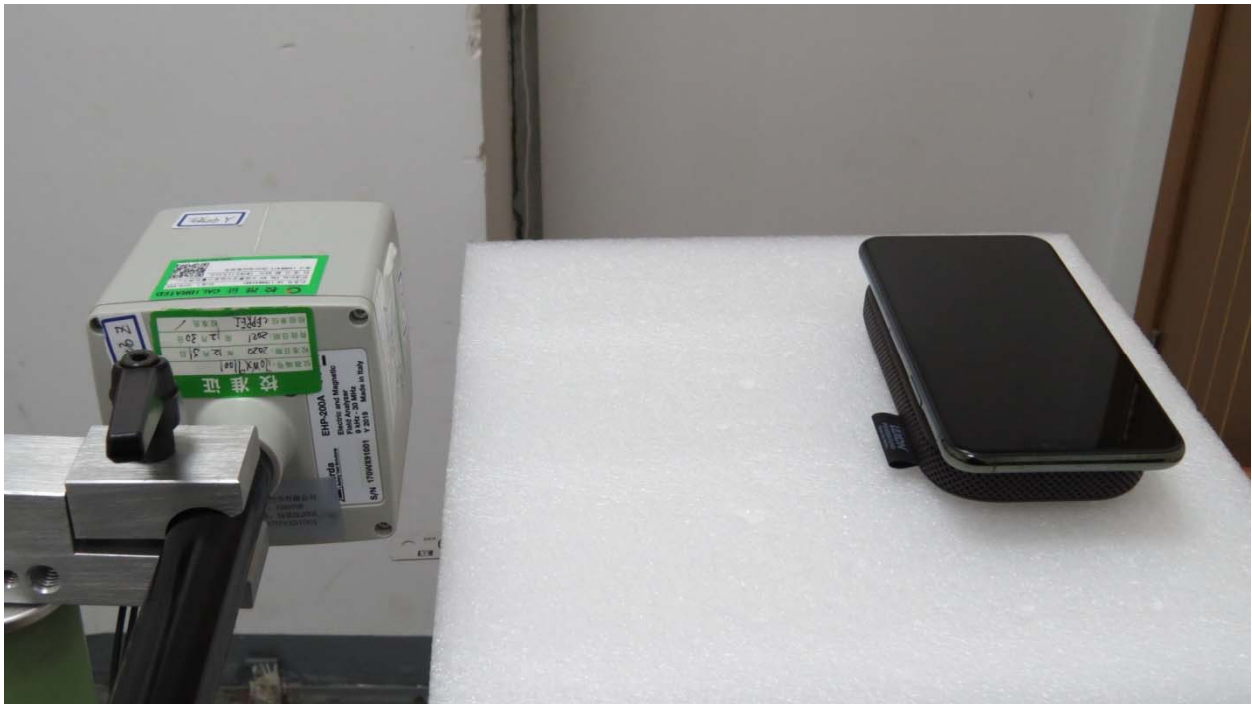
Picture 4: Right Side, the distance from EUT to the bottom of the Phantom is 15cm