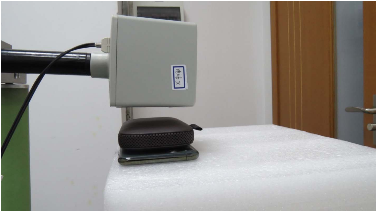
Picture 7: Back Side, the distance from EUT to the bottom of the Phantom is 15mm