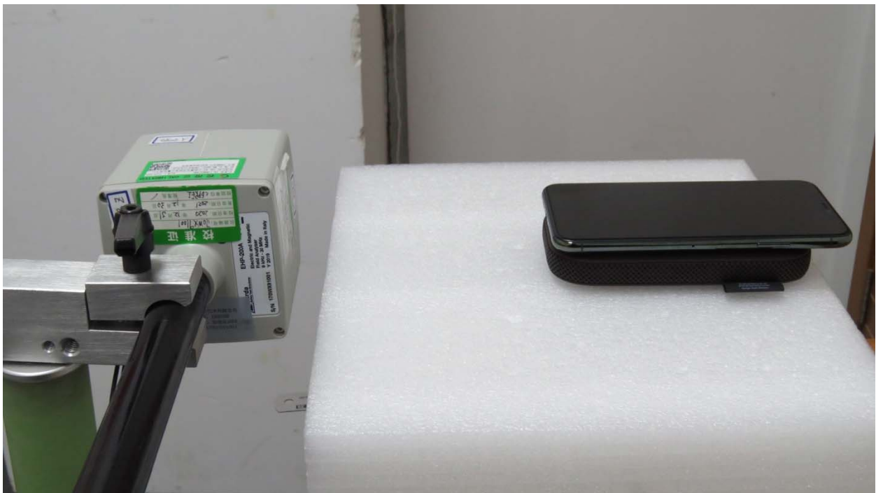
Picture 6: Bottom Edge, the distance from EUT to the bottom of the Phantom is 15cm