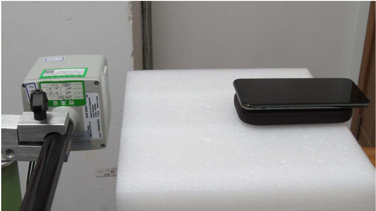
Picture 5: Top Side, the distance from EUT to the bottom of the Phantom is 15cm