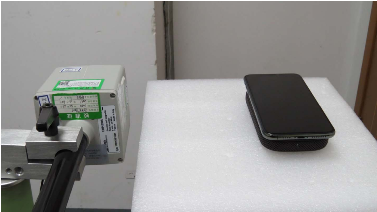
Picture 3: Left Side, the distance from EUT to the bottom of the Phantom is 15cm