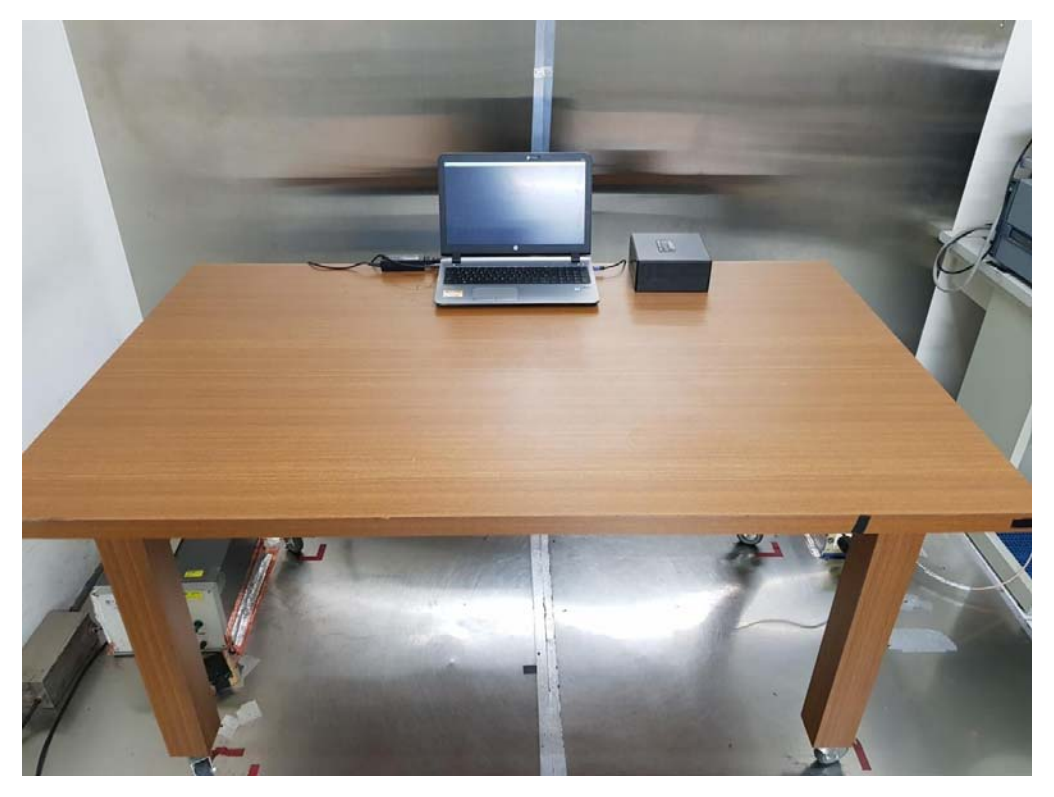
Radiated Measurement Photos (Below 30MHz)