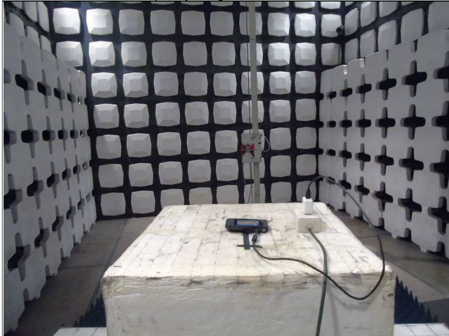
Frequency Range < Above 1GHz >