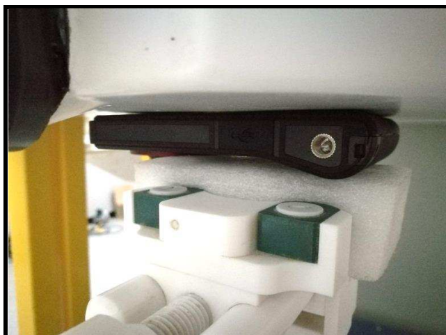
Front Face of EUT with 0 cm Gap