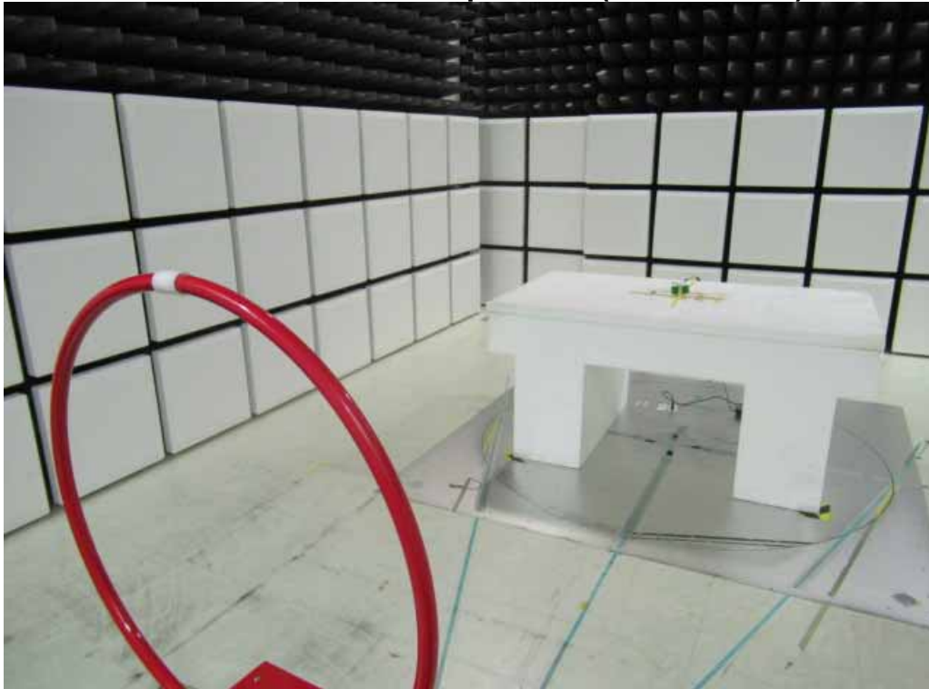
Radiated Emission Setup Photos (30MHz~1GHz)