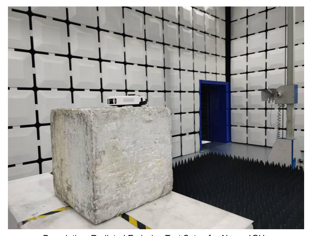
Description: Radiated Emission Test Setup for Above 1GHz