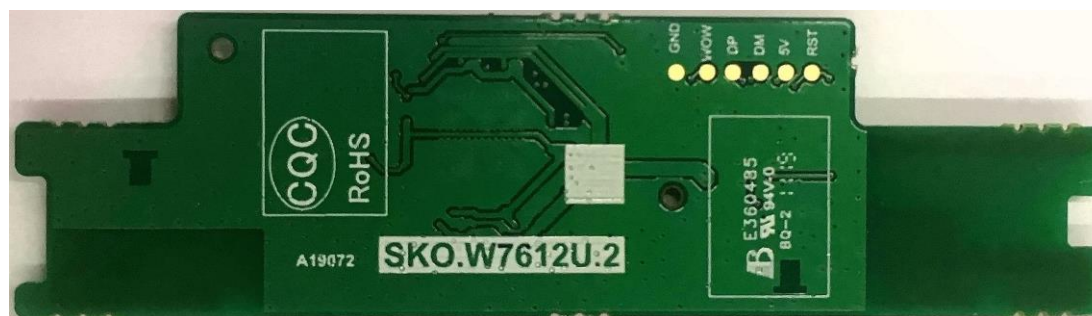
背视图 (bottom view)