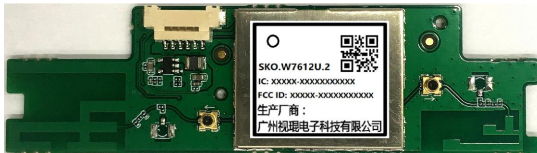
正视图 (top view)