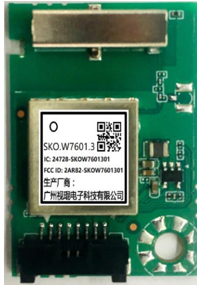
正视图 (top view)