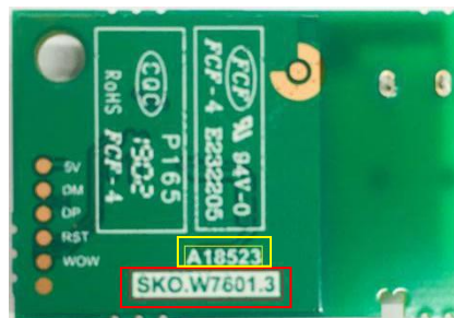
背视图 (bottom view)