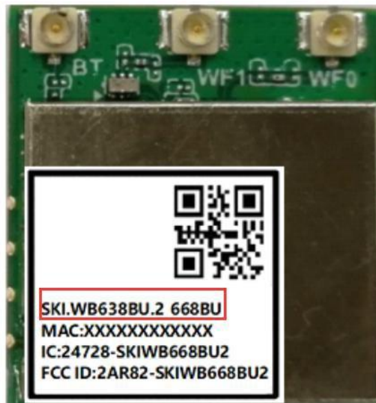
正视图 (top view)