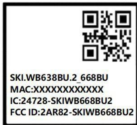
标签信息 (information view)