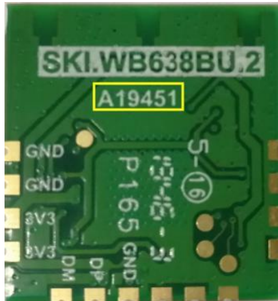
背视图 (bottom view)