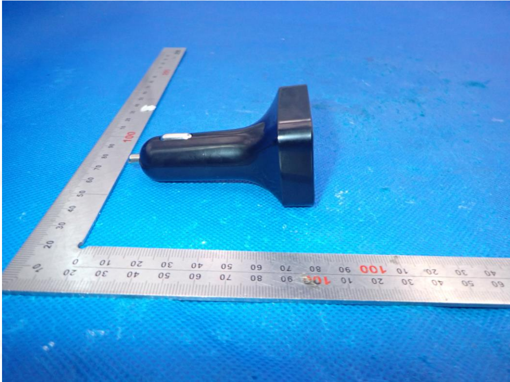
PORT VIEW OF EUT