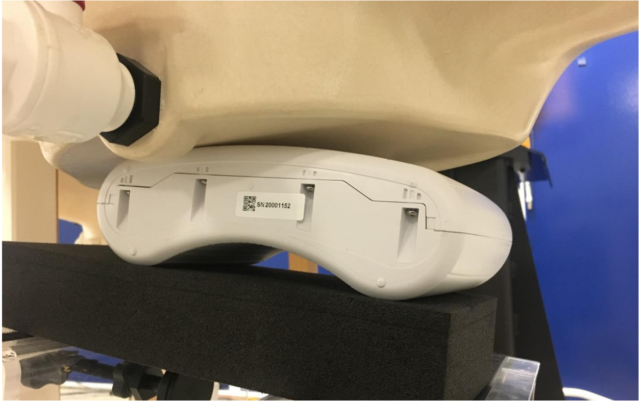
“Outside” Test Positions