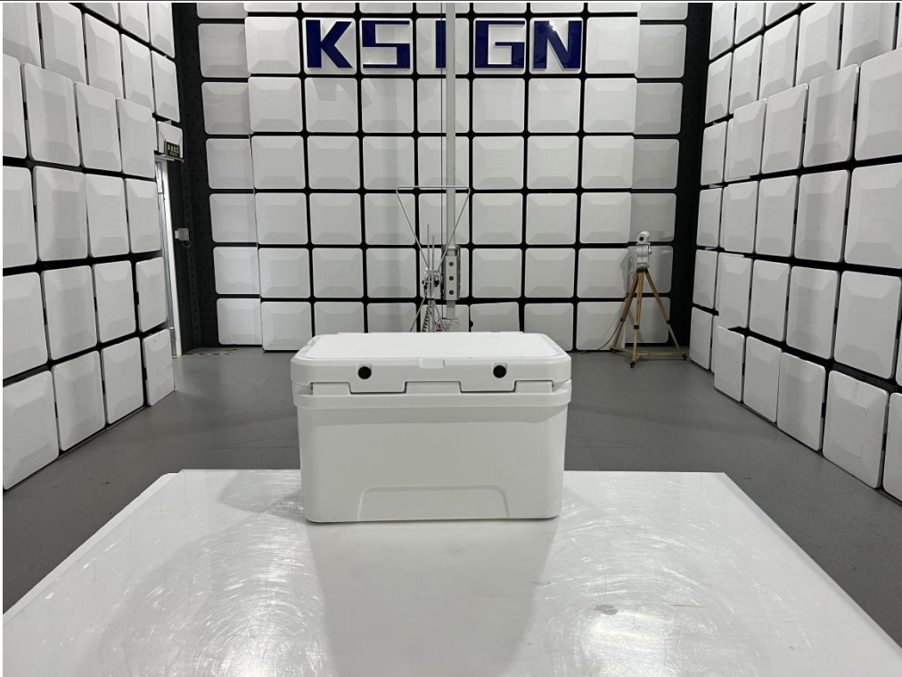
Emissions in frequency bands (above 1GHz)