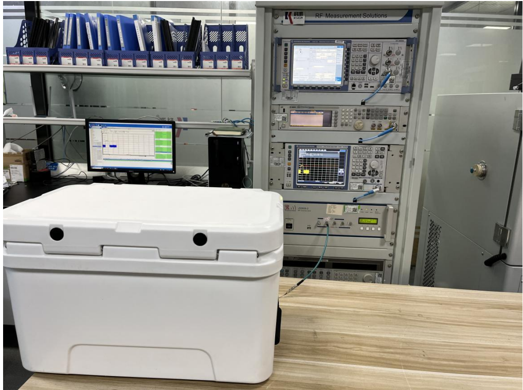
Conducted Emission at AC power line