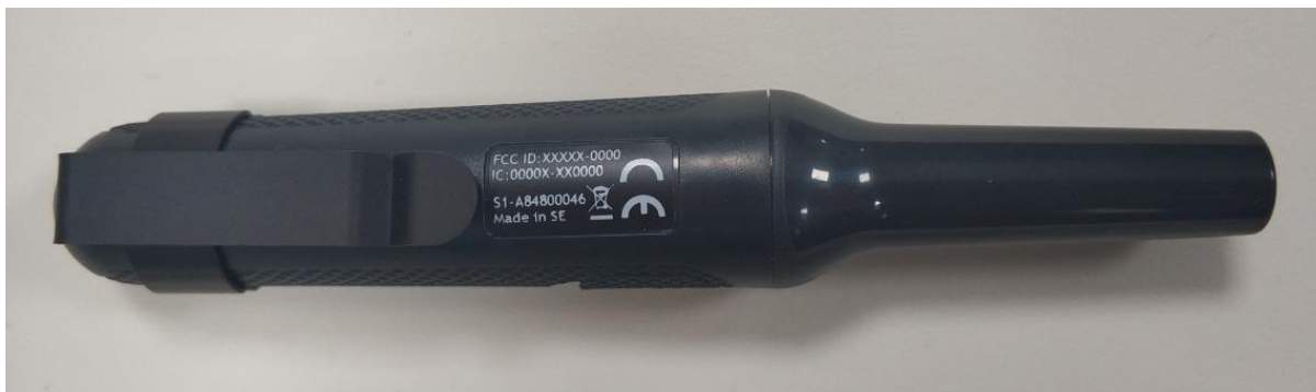
Figure 2: The placement of the product label.

The product label of the Seco Idem Reader 1 is placed on the unit in a small recess of the plastic handle next to the metal clip. See figure 2 below.